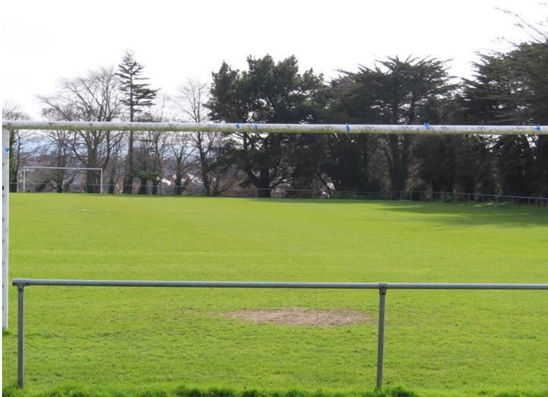
Diagram 1.19: Whitehall College, with Home Farm Football Club Pitch in Foreground