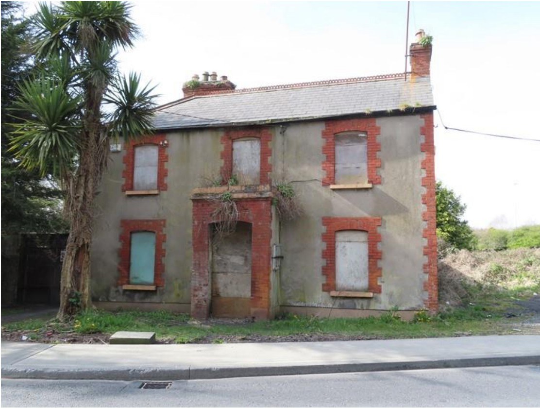
Diagram 1.13: House to the North of Santry Lodge