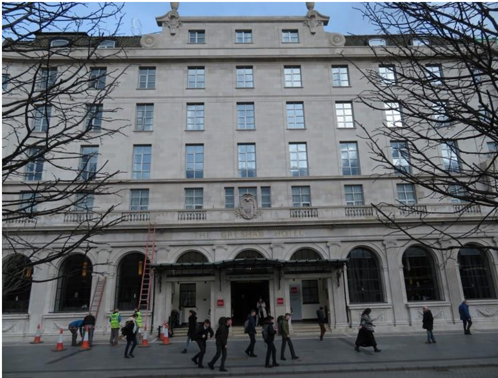
Diagram 1.43: Gresham Hotel, 20-22 O'Connell Street Upper