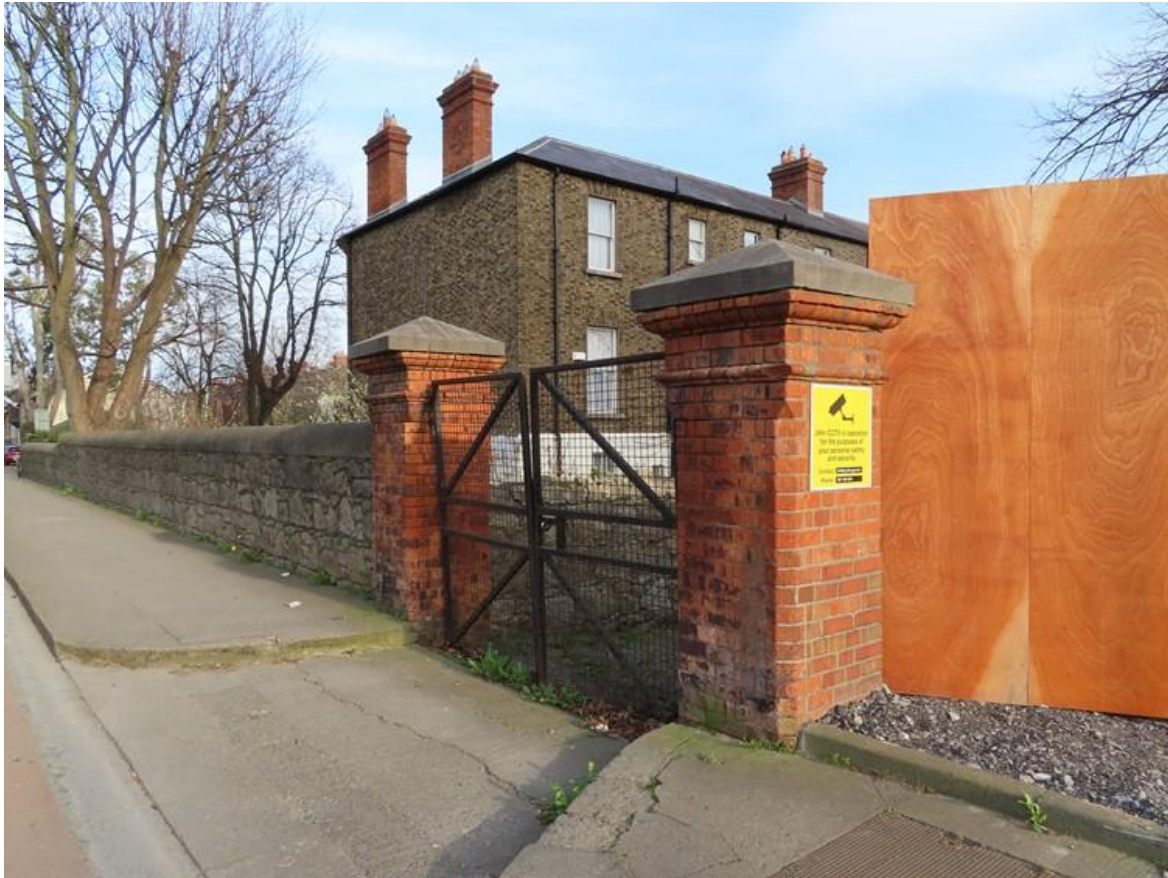
Diagram 1.89: Gateway from Grand Parade to Laneway at Rear of 1-17 Dartmouth Square