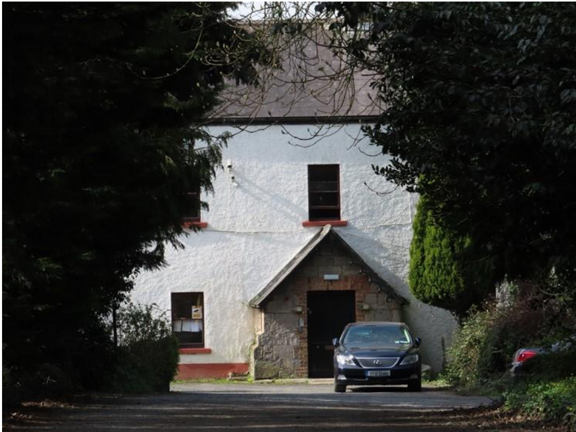
Diagram 1.12: Gate Lodge at Santry Lodge