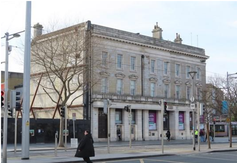
Diagram 1.45: AIB Bank, 37-38 O'Connell Street Upper