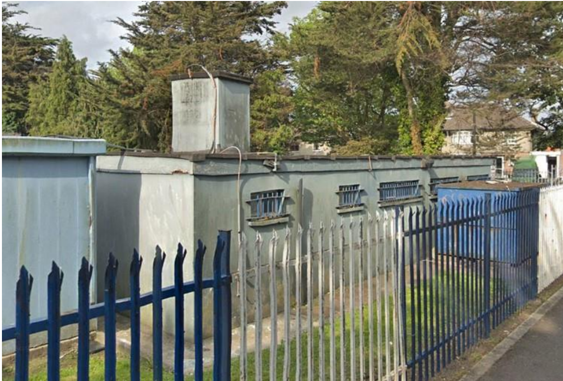
Diagram 1.21: Home Farm Football Club Building