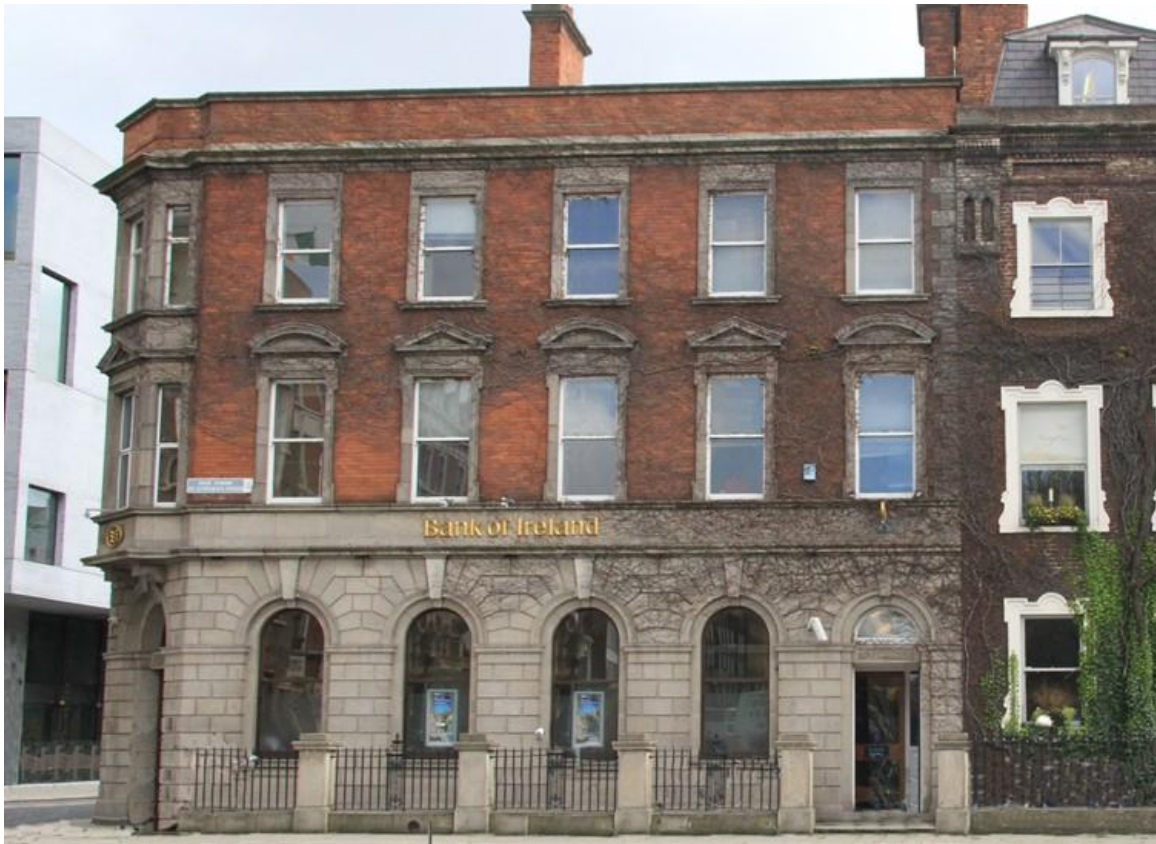
Diagram 1.79: Number 39-40 St Stephen's Green