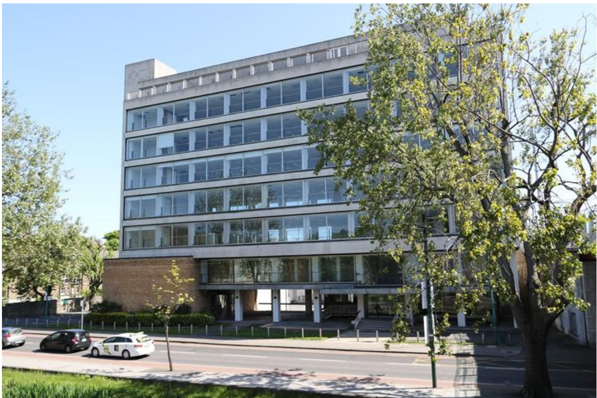
Diagram 1.86: Carroll's Building, Grand Parade