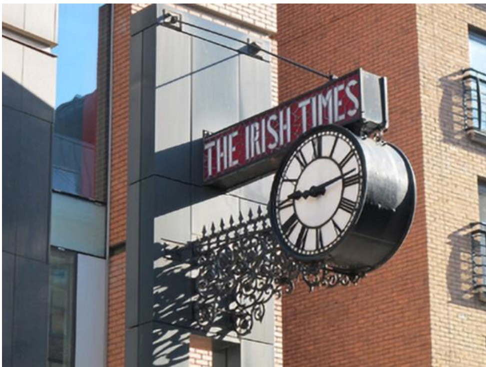
Diagram 1.64: Irish Times Clock