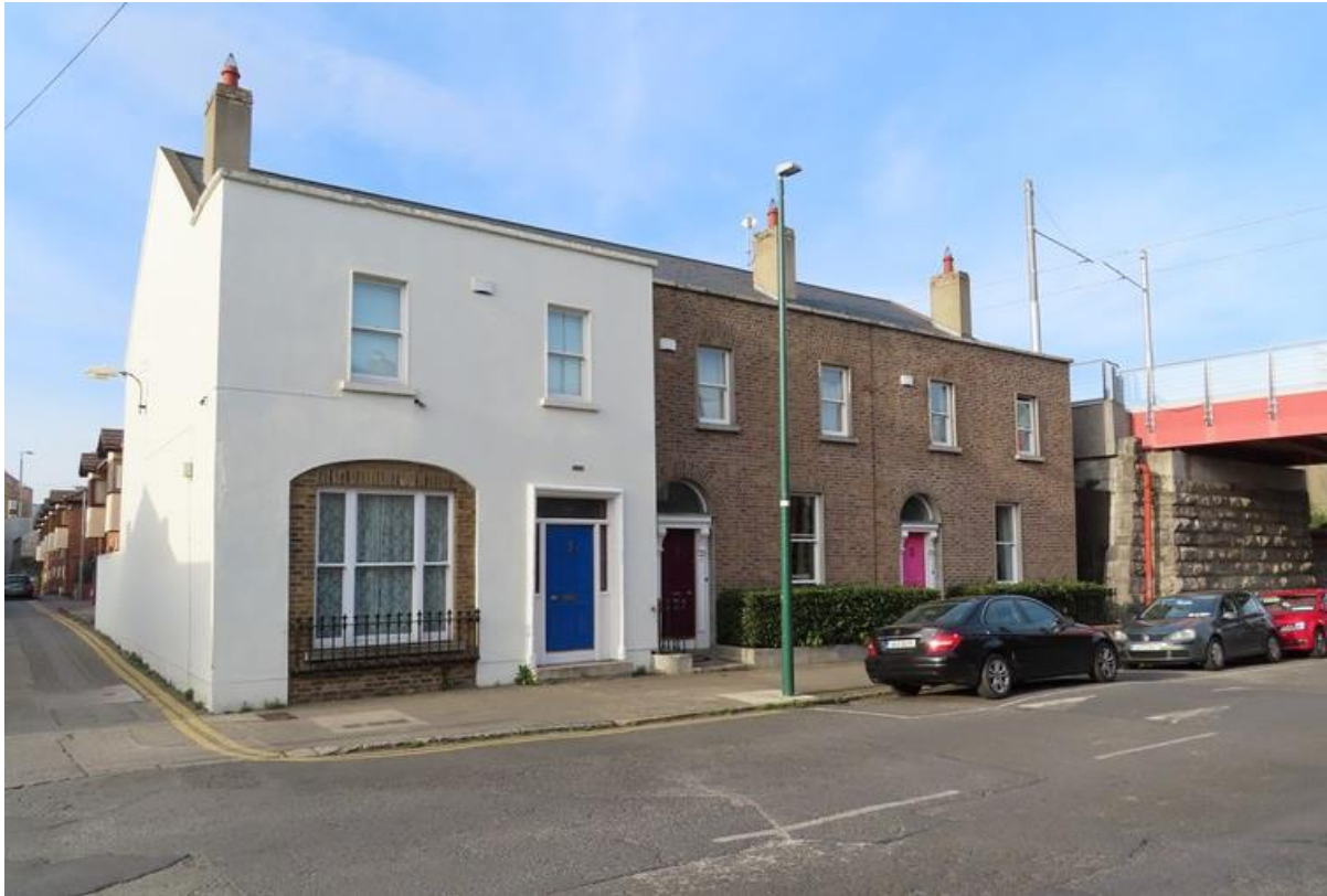
Diagram 1.99: Numbers 26 to 28 Dartmouth Road