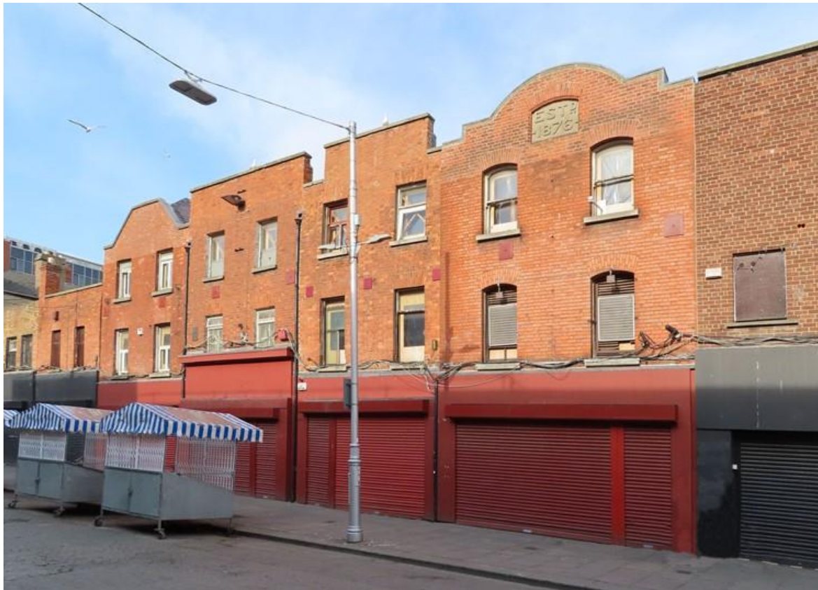
Diagram 1.58: 14 to 17 Moore Street