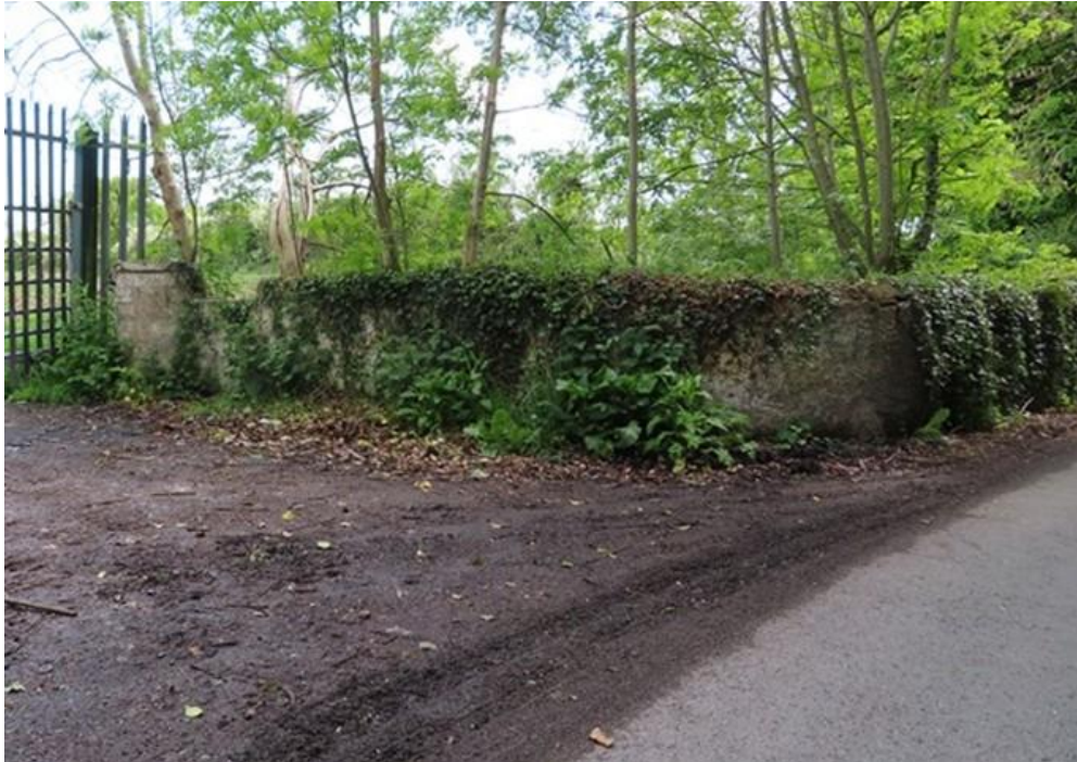
Diagram 1.1: Wall at Gateway to Lissenhall Little on Ennis Lane

Diagram 1.1 to Diagram 1.100 comprise of photographs of architectural constraints along the proposed Project alignment.