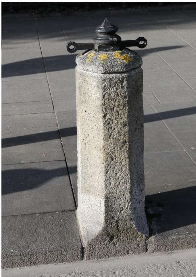
Diagram 1.69: Granite Bollard