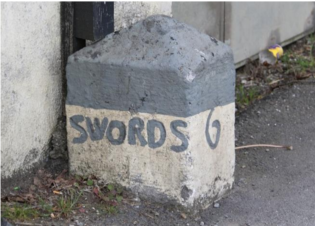
Diagram 1.8: Milestone on R132