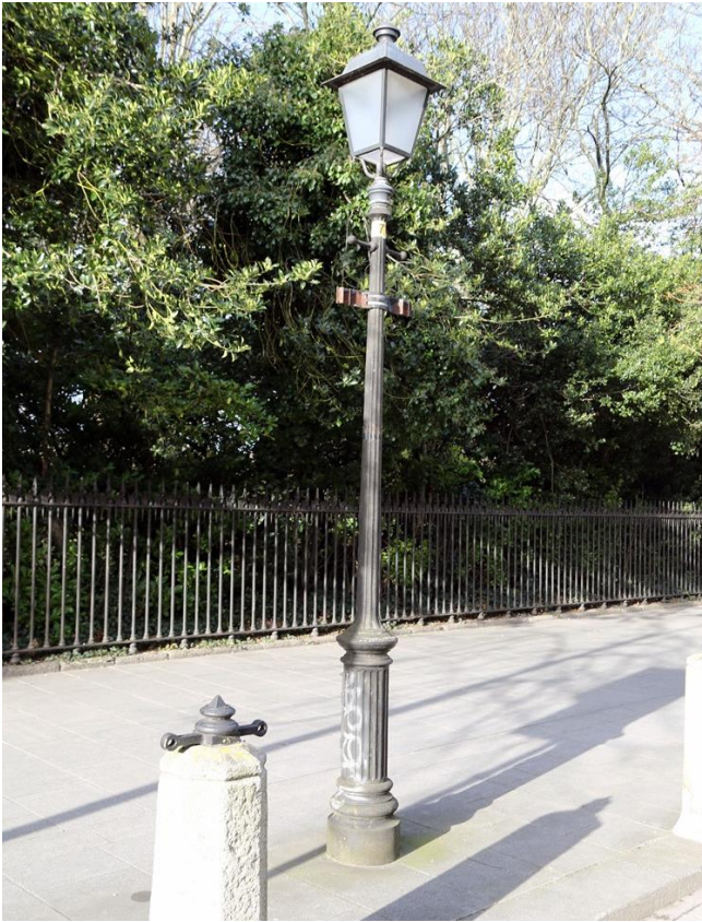
Diagram 1.71: Traditional-Style Lamp Post