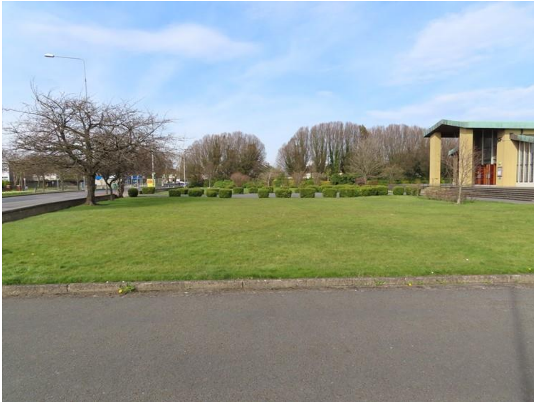
Diagram 1.15: Church of Our Lady of Victories, Ballymun Road