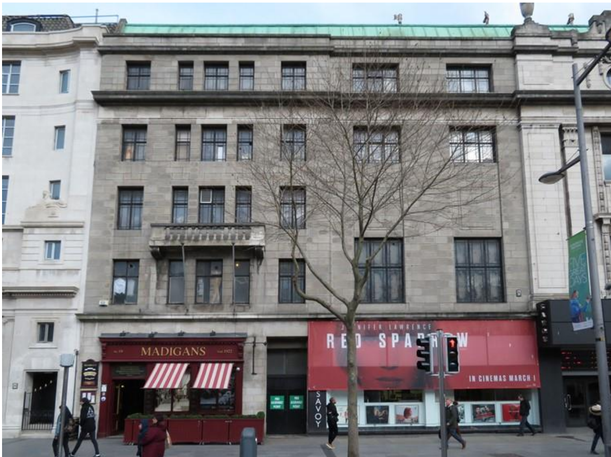
Diagram 1.42: 18 and 19 O'Connell Street Upper