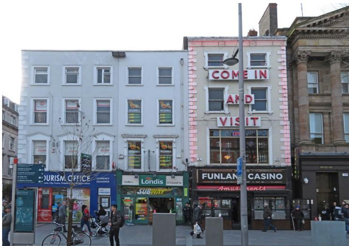
Diagram 1.55: 67-69 O'Connell Street Upper