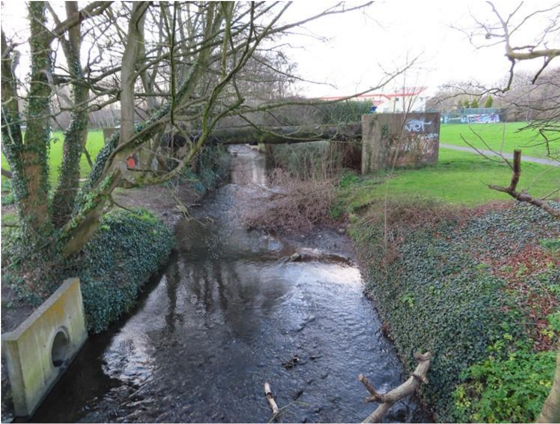
Diagram 1.7: Footbridge over Ward River