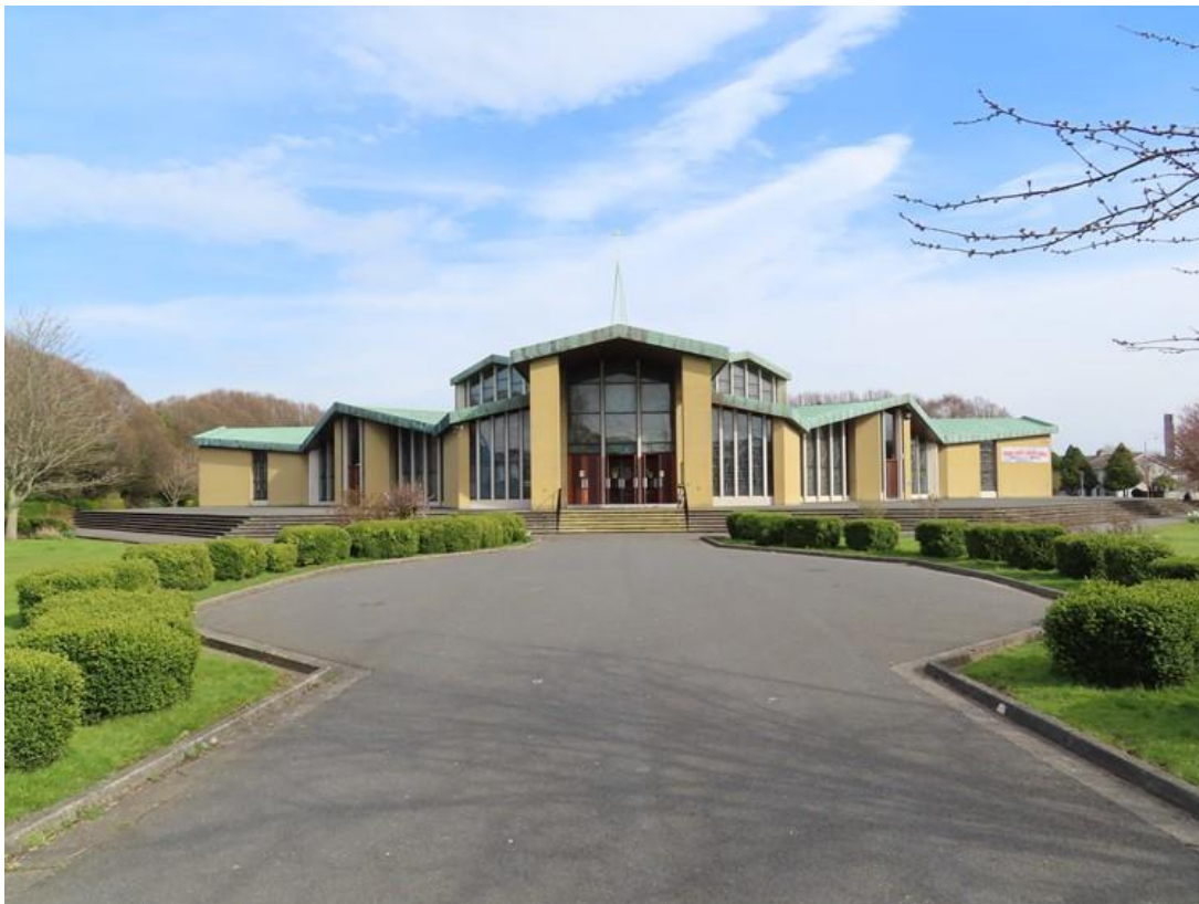
Diagram 1.16: Landscaped Area to the Front of Church of Our Lady of Victories