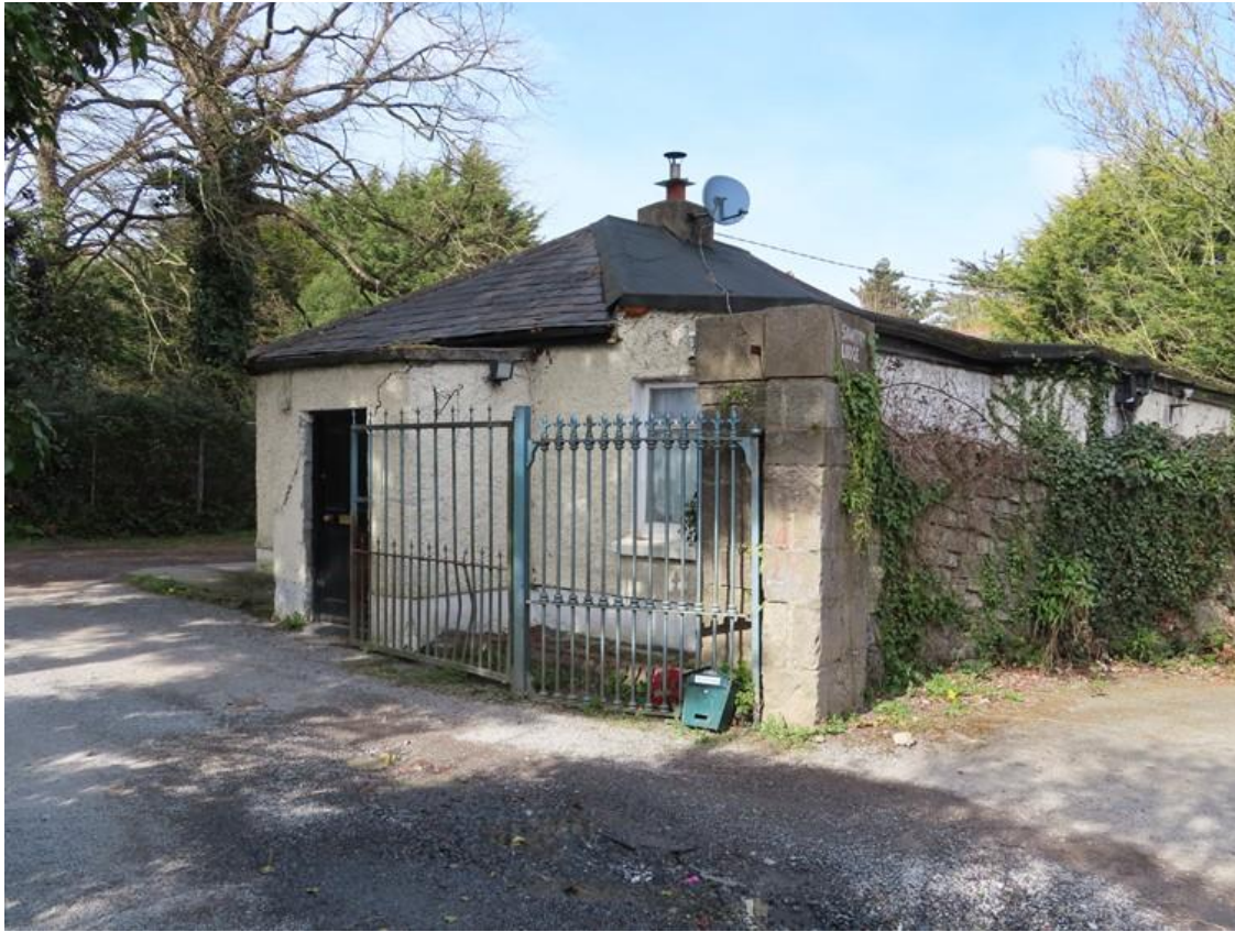
Diagram 1.11: Santry Lodge