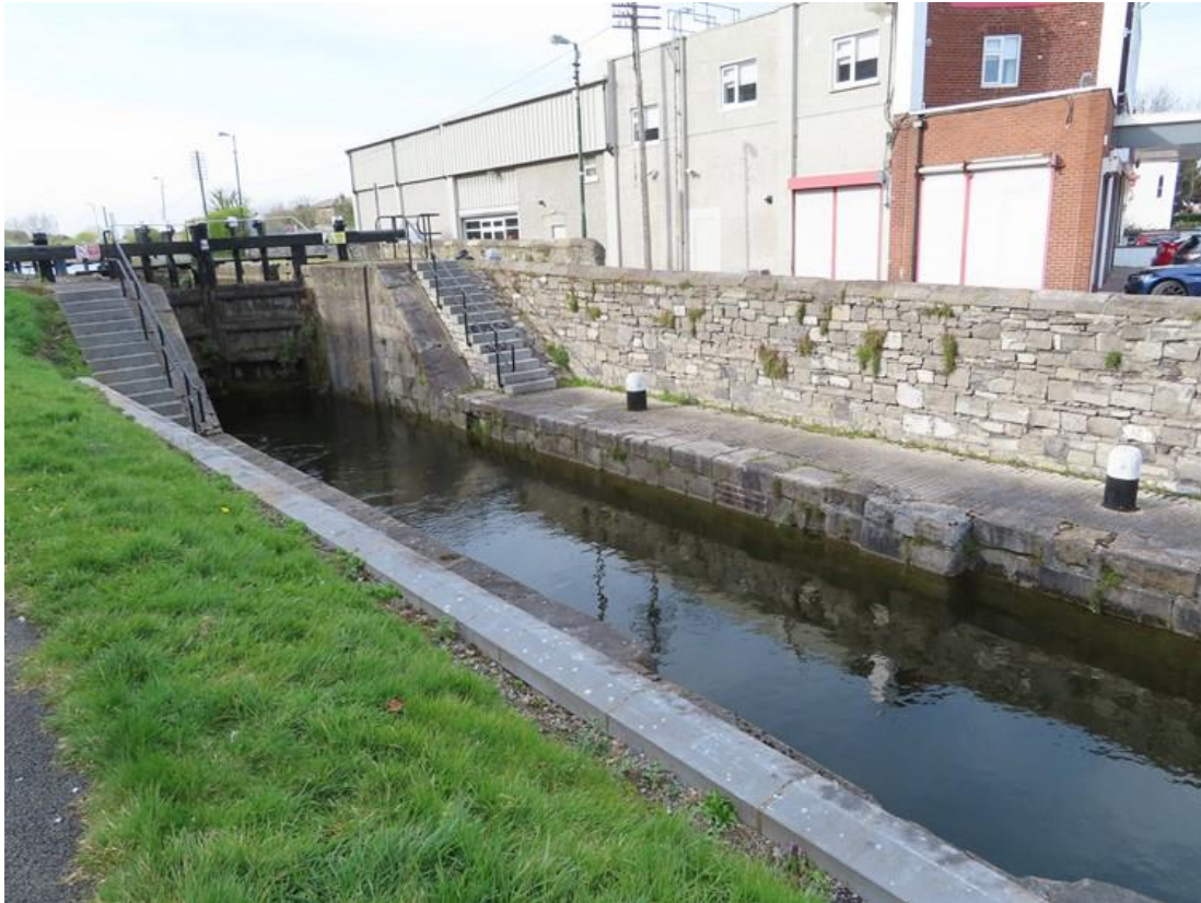
Diagram 1.27: Fifth Lock on Royal Canal