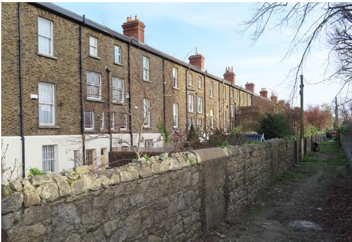
Diagram 1.92: Rear of 1-17 Dartmouth Square