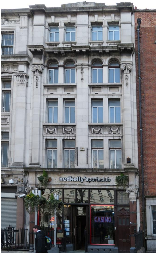
Diagram 1.47: 43 O'Connell Street Upper