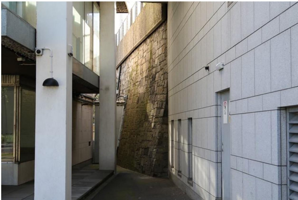
Diagram 1.87: Harcourt Street Railway Viaduct at the Rear of the Carroll's Building