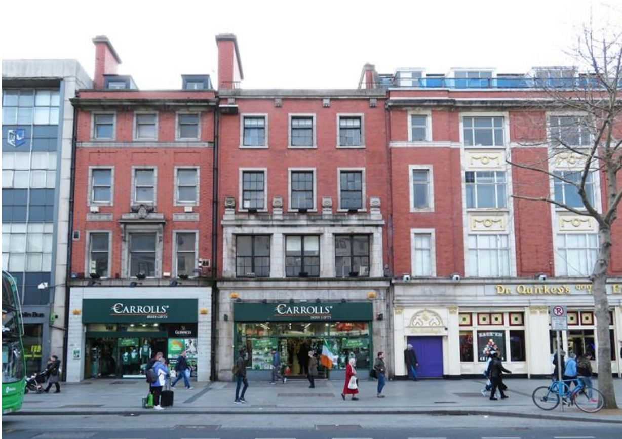
Diagram 1.50: 55-58 O'Connell Street Upper