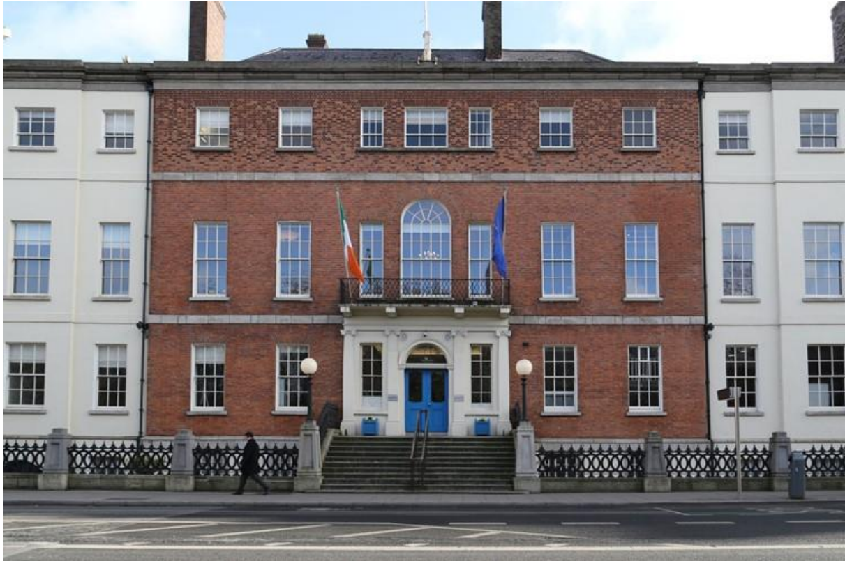
Diagram 1.83: Number 51 St Stephen's Green