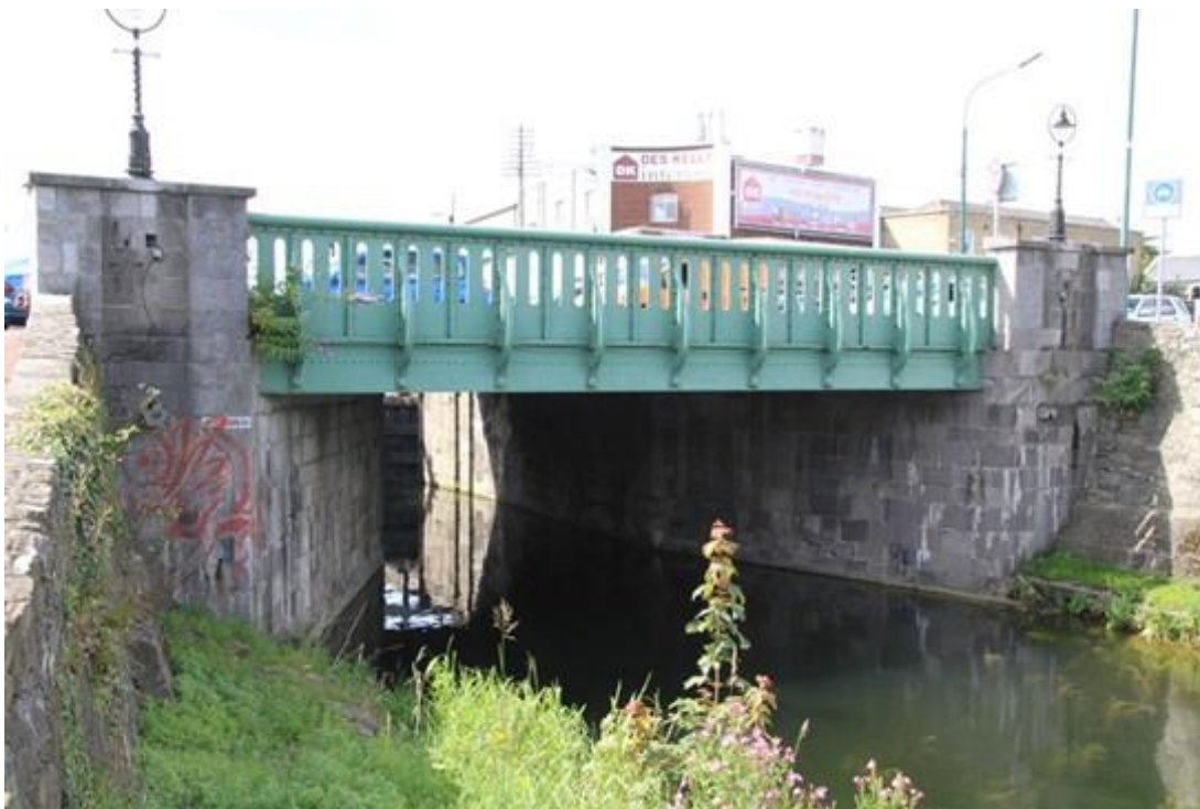
Diagram 1.28: Cross Guns Bridge