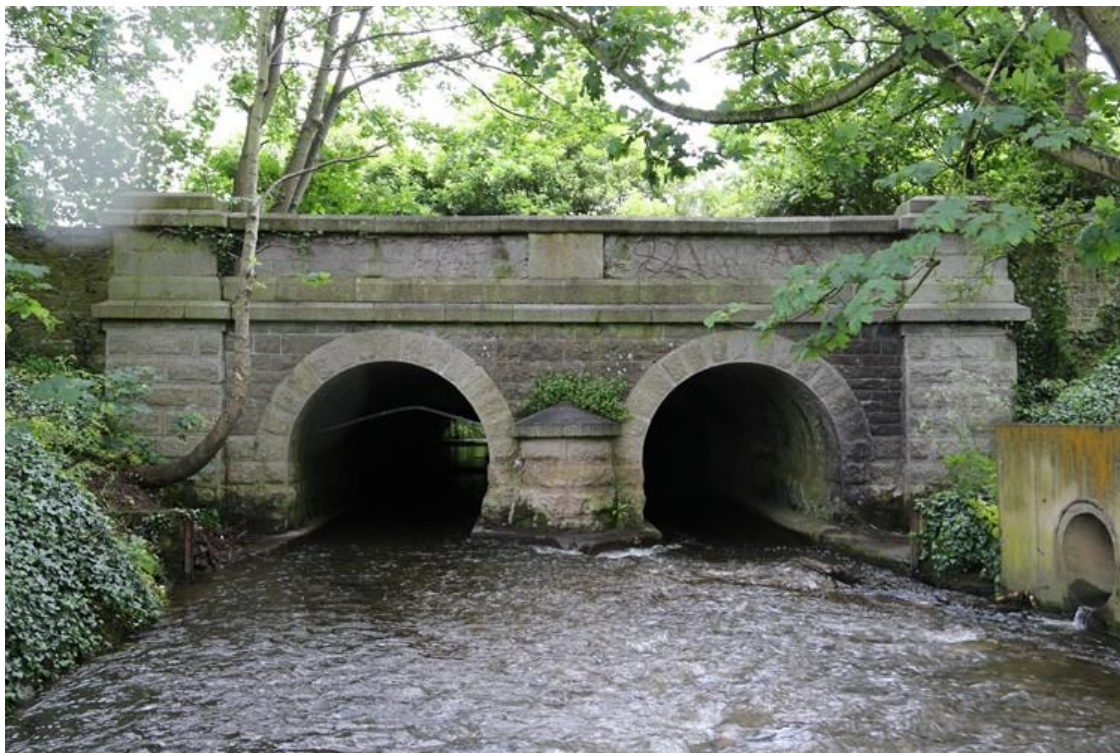
Diagram 1.5: Balheary Bridge