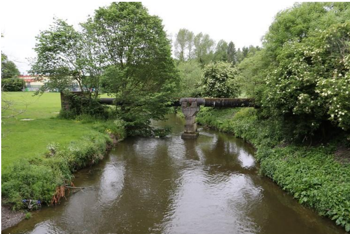
Diagram 1.4: View Upstream from Lissenhall Bridge