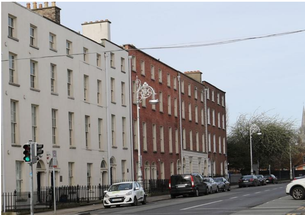
Diagram 1.40: Houses in Eccles Street, with Four Masters Park in the Background