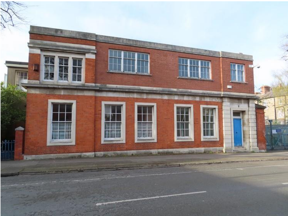
Diagram 1.96: Commercial Building at 19-25 Dartmouth Road