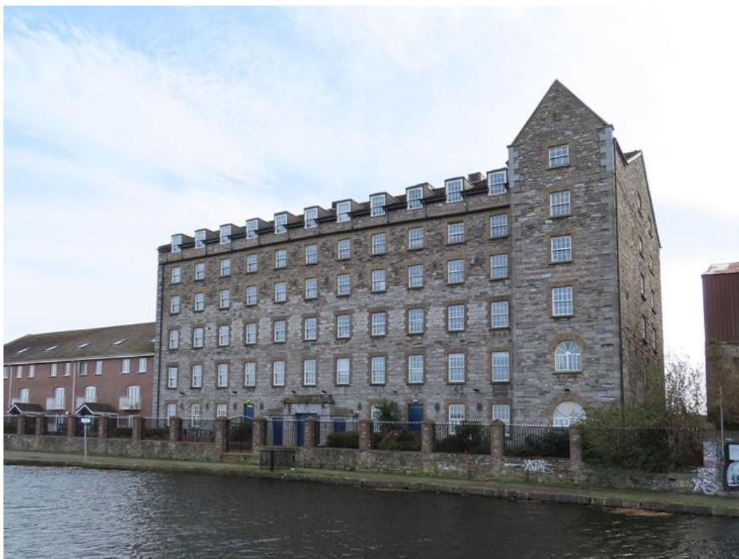
Diagram 1.25: North City Mill