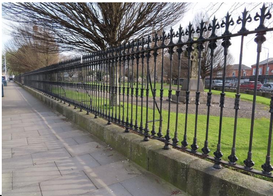
Diagram 1.35: Park Plinth Wall and Railings on Eccles Street Frontage