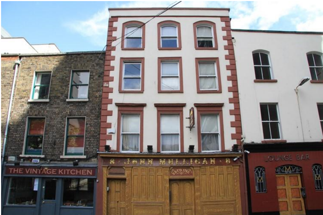
Diagram 1.61: Number 8 Poolbeg Street