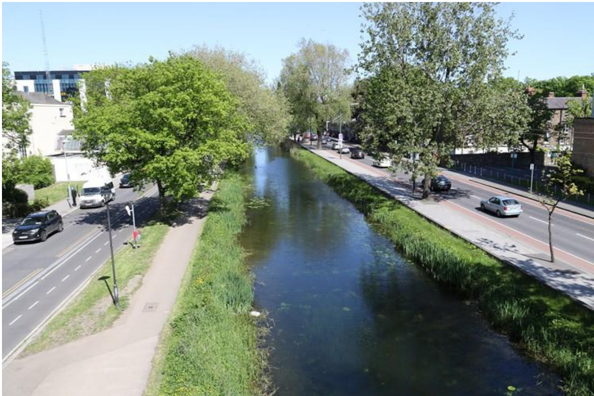
Diagram 1.85: Grand Canal at Grand Parade