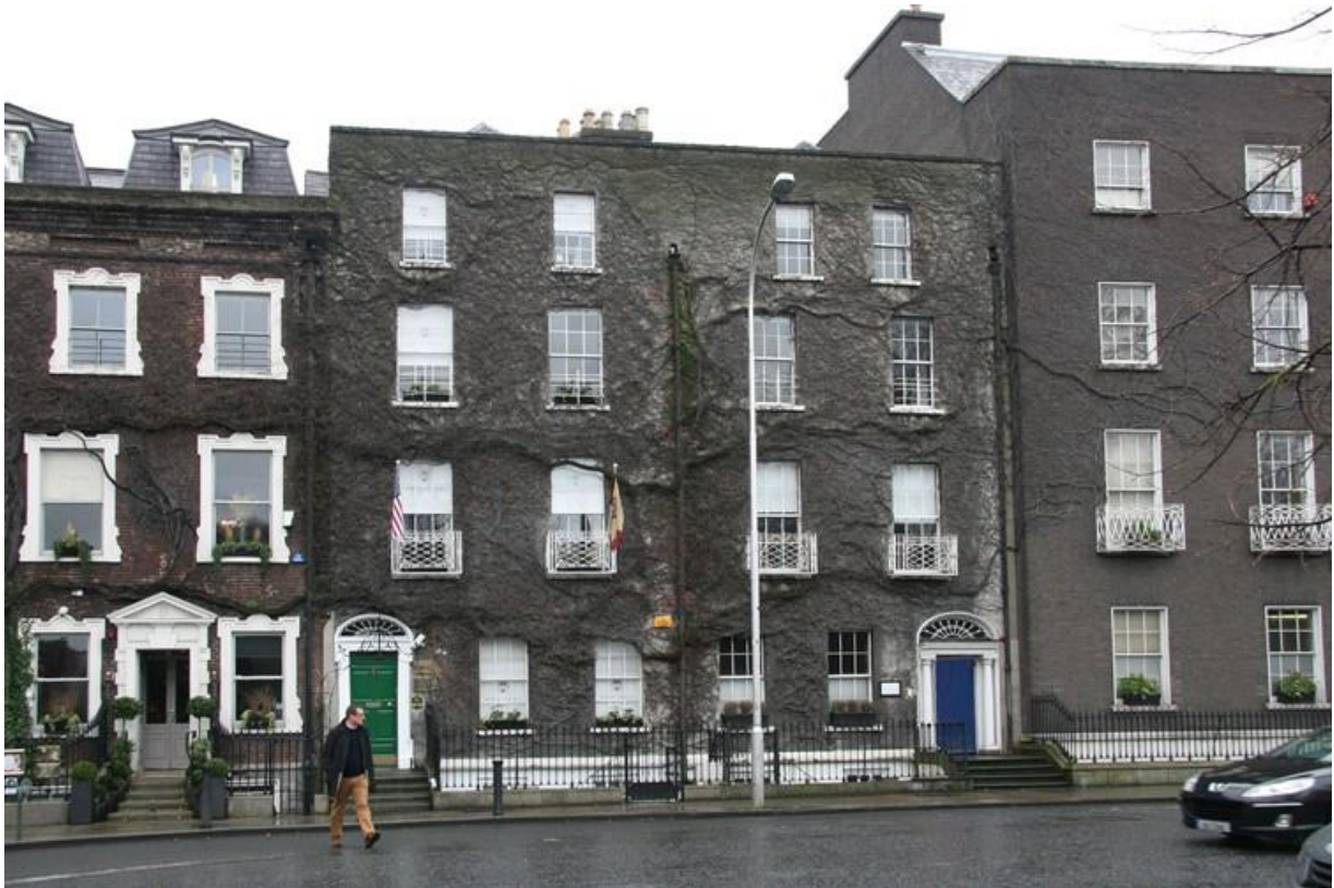
Diagram 1.81: Numbers 42 & 43 St Stephen's Green