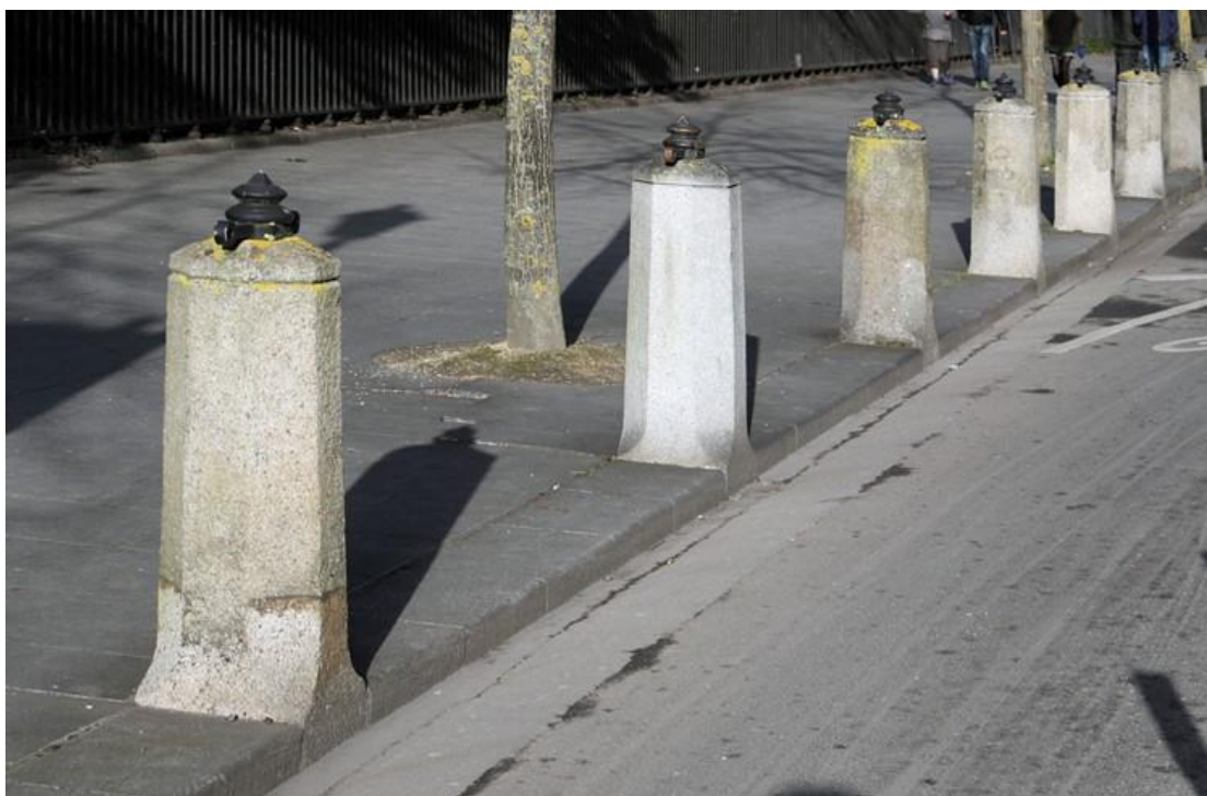
Diagram 1.70: Granite Bollards on Eastern Side of St Stephen's Green