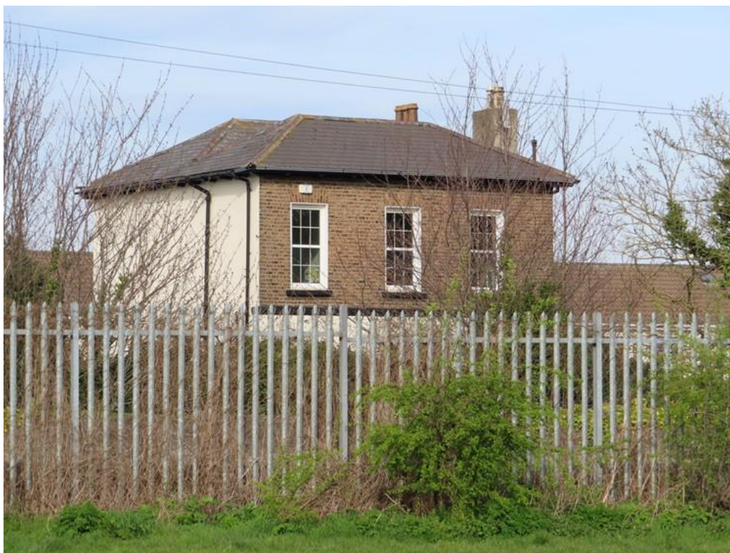
Diagram 1.26: Prospect Lodge