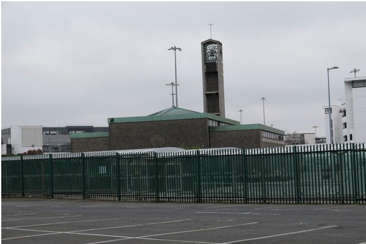
Diagram 1.9: Church of Our Lady Queen of Heaven