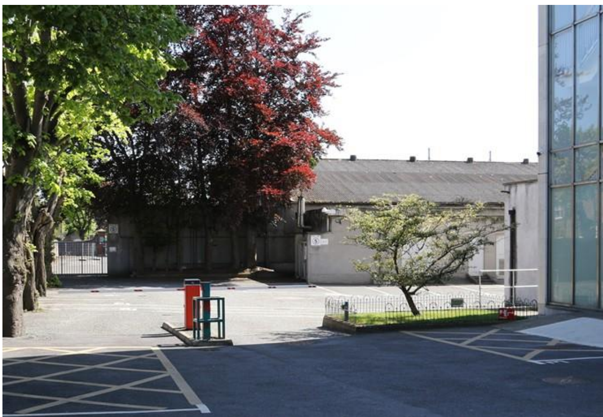
Diagram 1.88: Structures at the Rear of the Carroll's Building