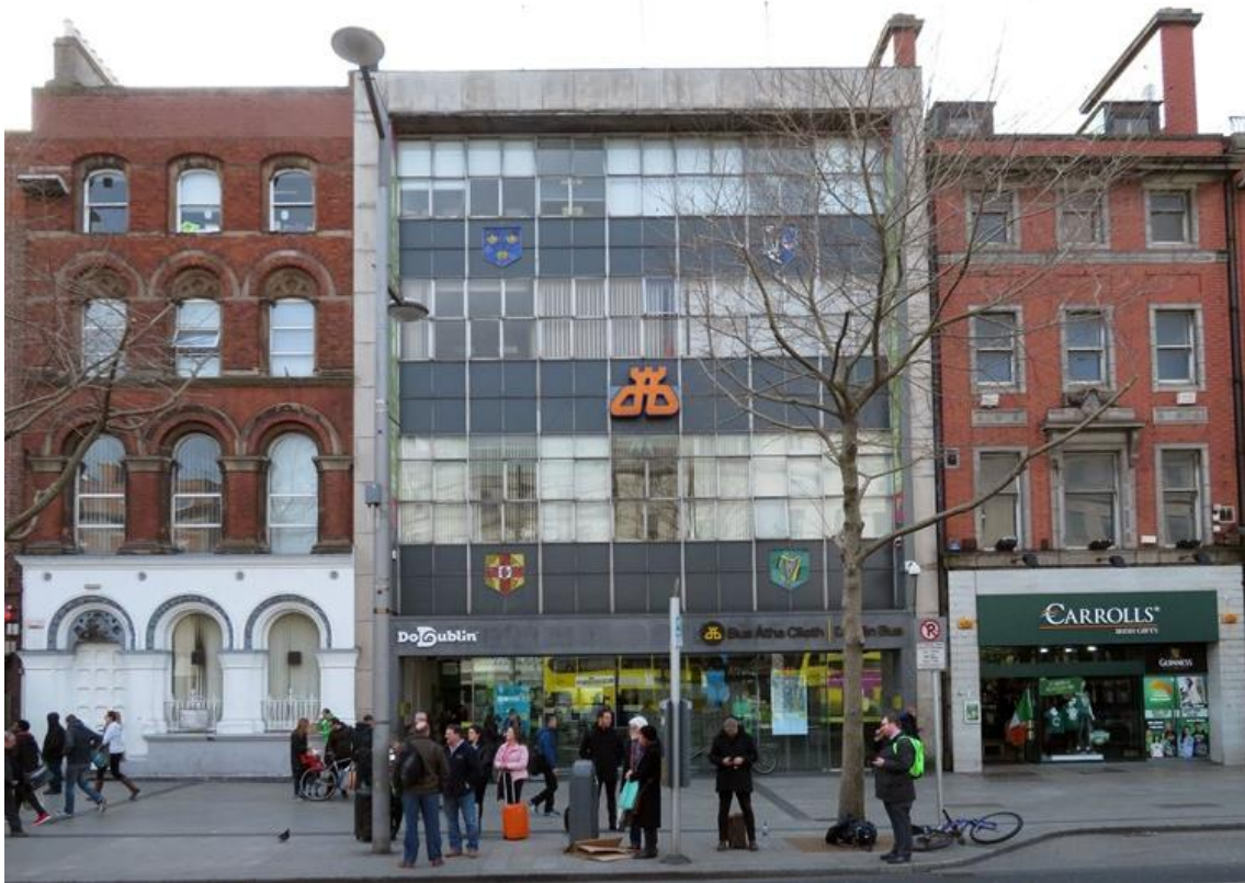
Diagram 1.51: 59 O'Connell Street Upper