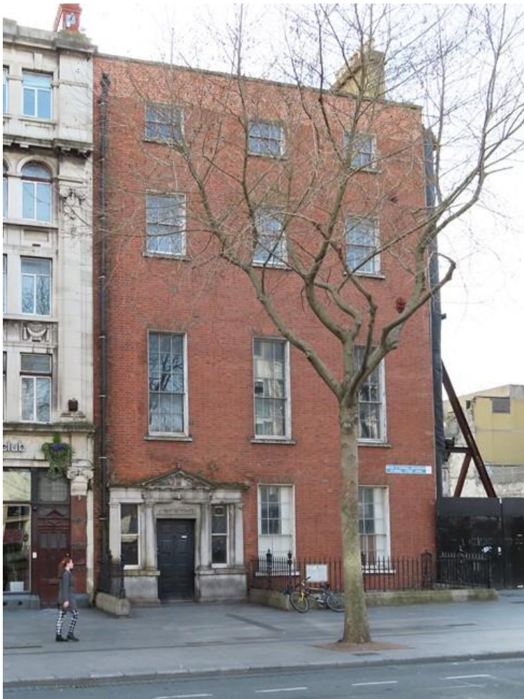
Diagram 1.46: 42 O'Connell Street Upper