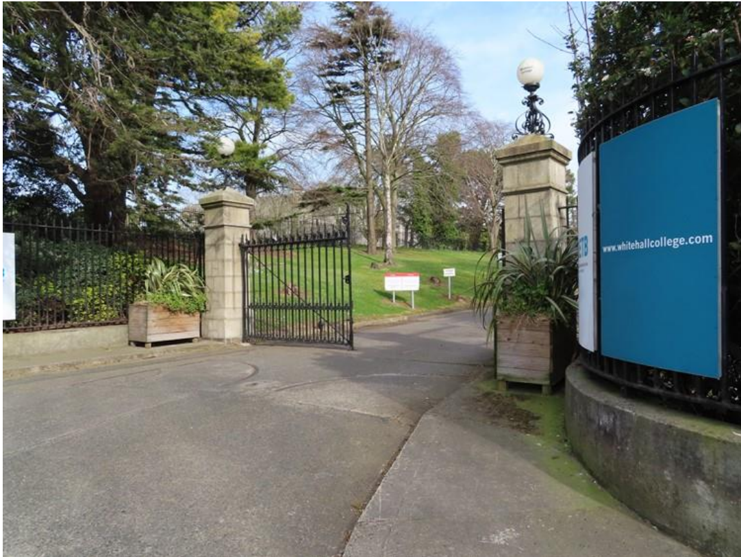
Diagram 1.23: Gateway to Whitehall College with Site for Access to Station Beyond