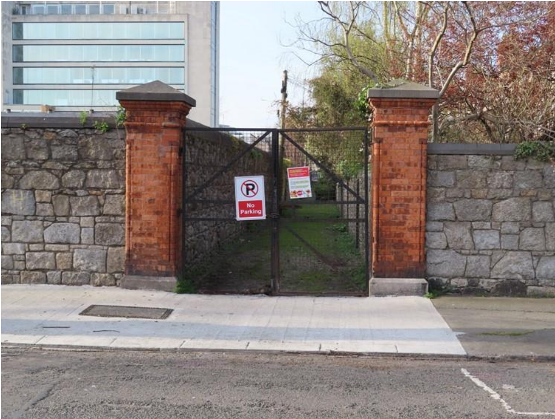
Diagram 1.95: Gateway at Southern End of Laneway at Rear of 1-17 Dartmouth Square