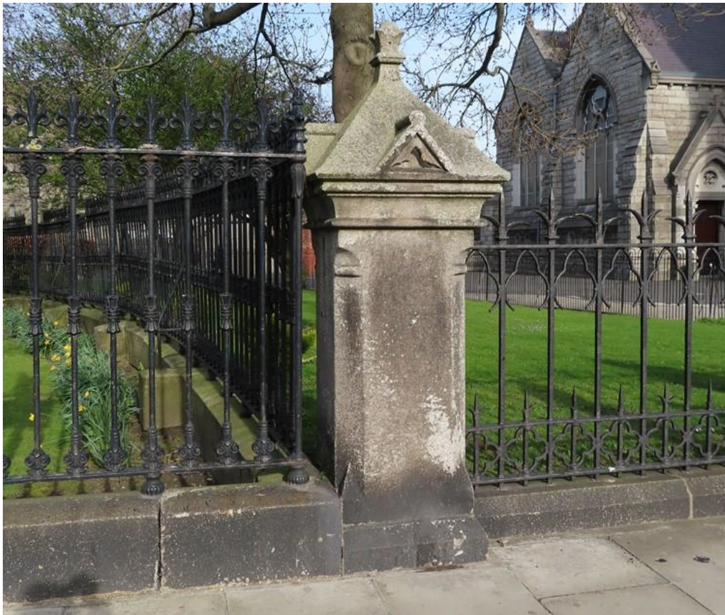
Diagram 1.39: Railings of Park, at Left, and Pier and Railings of St Joseph's Church