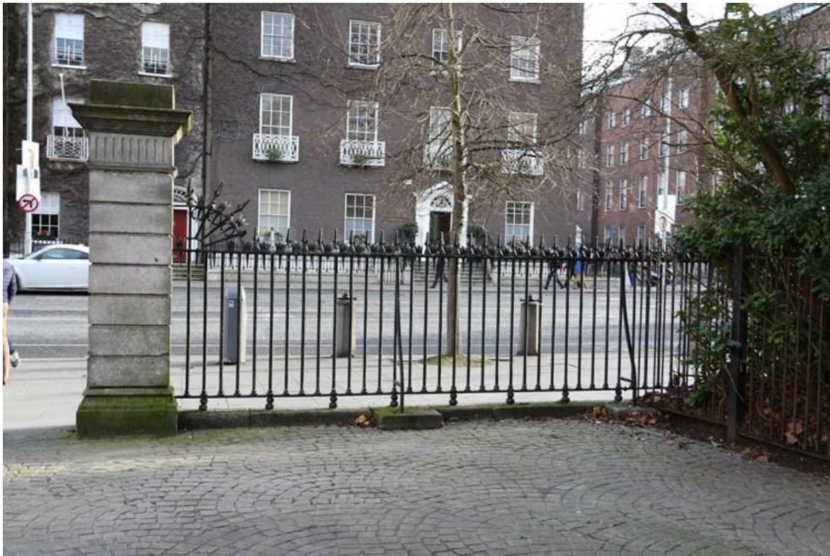
Diagram 1.73: Granite Pier Terminating Park Railings