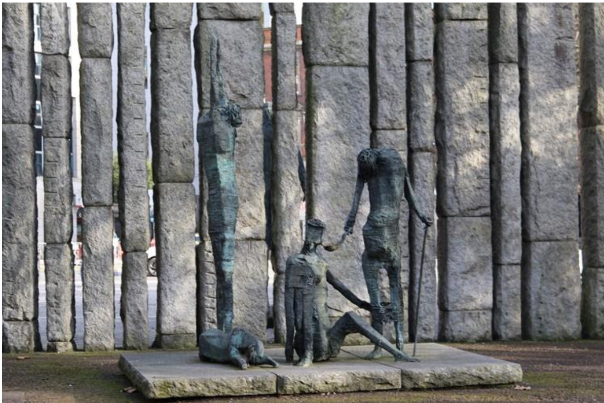
Diagram 1.76: Famine Sculpture in St Stephen's Green Park