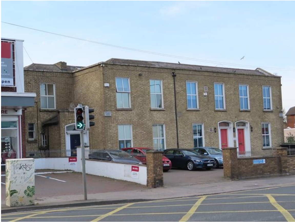
Diagram 1.31: Terrace at Prospect House, Prospect Road