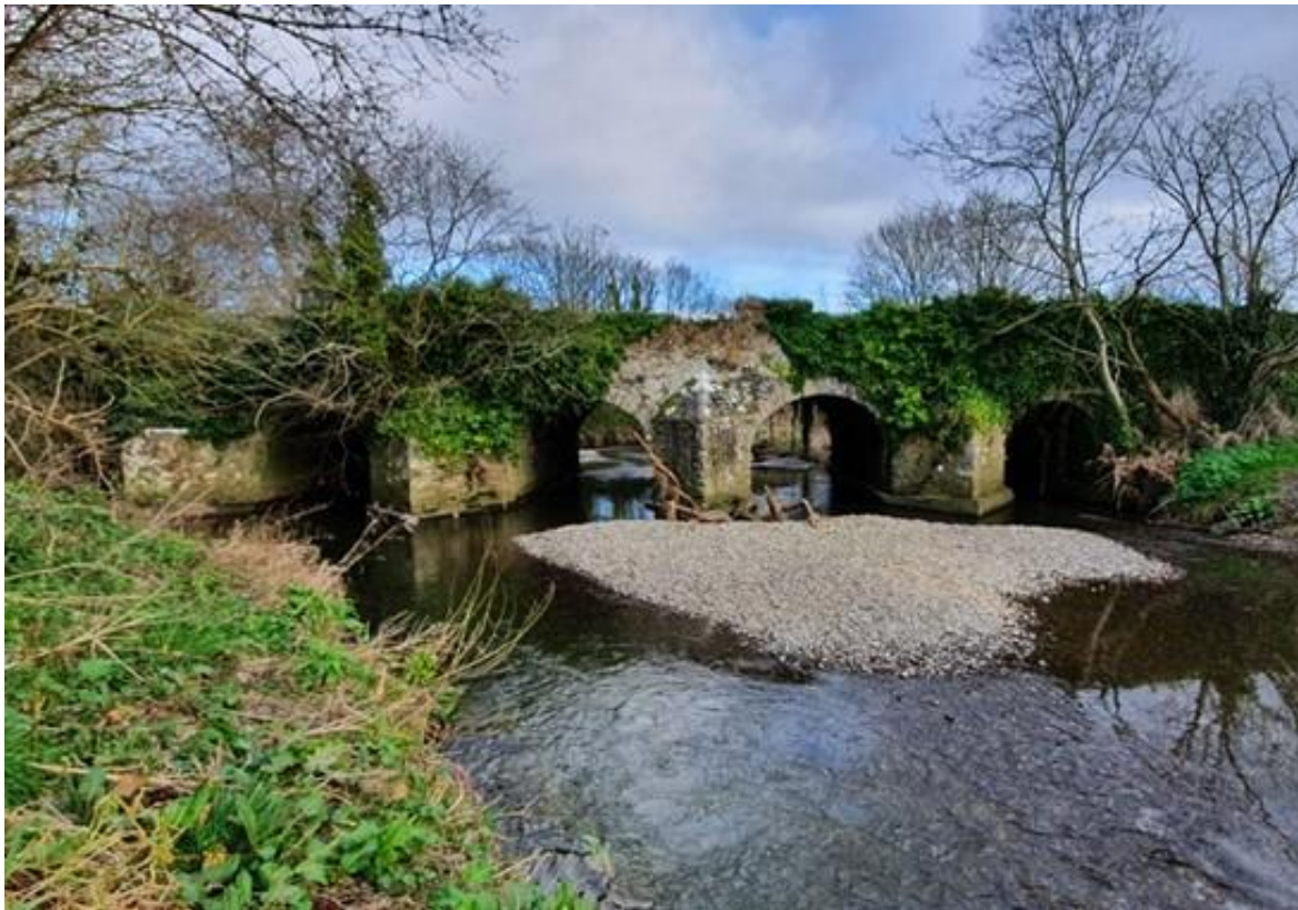
Diagram 1.3: Lissenhall Bridge