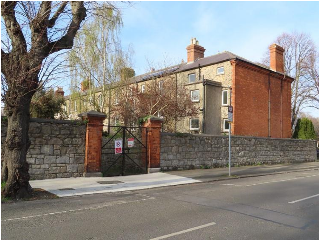
Diagram 1.94: Rear of 1-17 Dartmouth Square at Southern End of Terrace