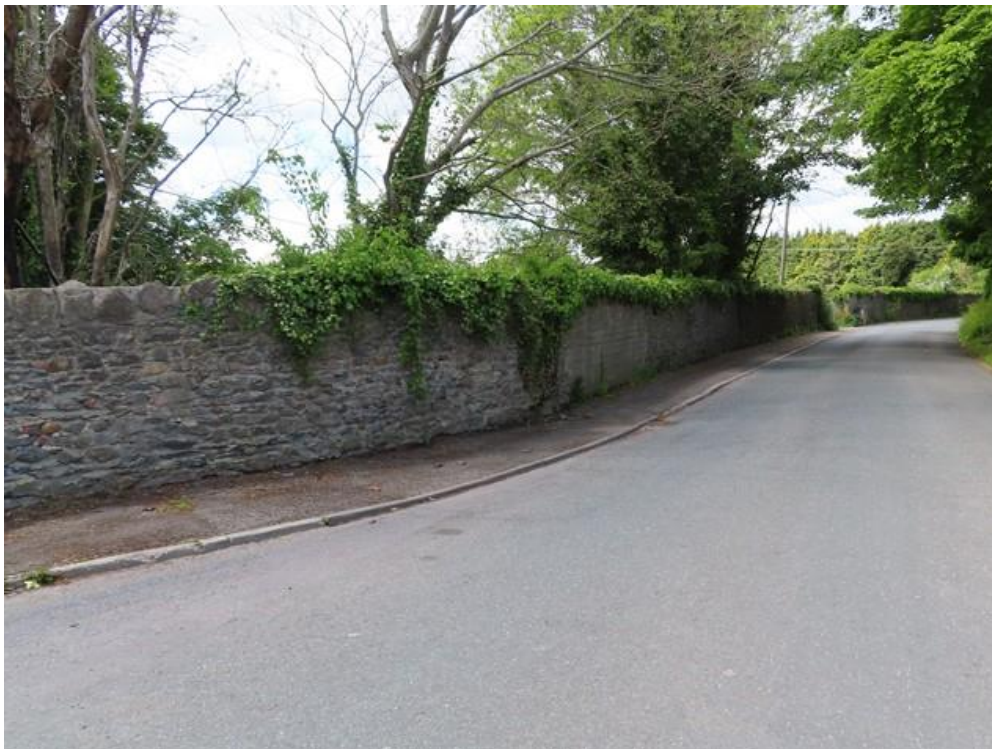
Diagram 1.2: Demesne Wall to Balheary House on Ennis Lane