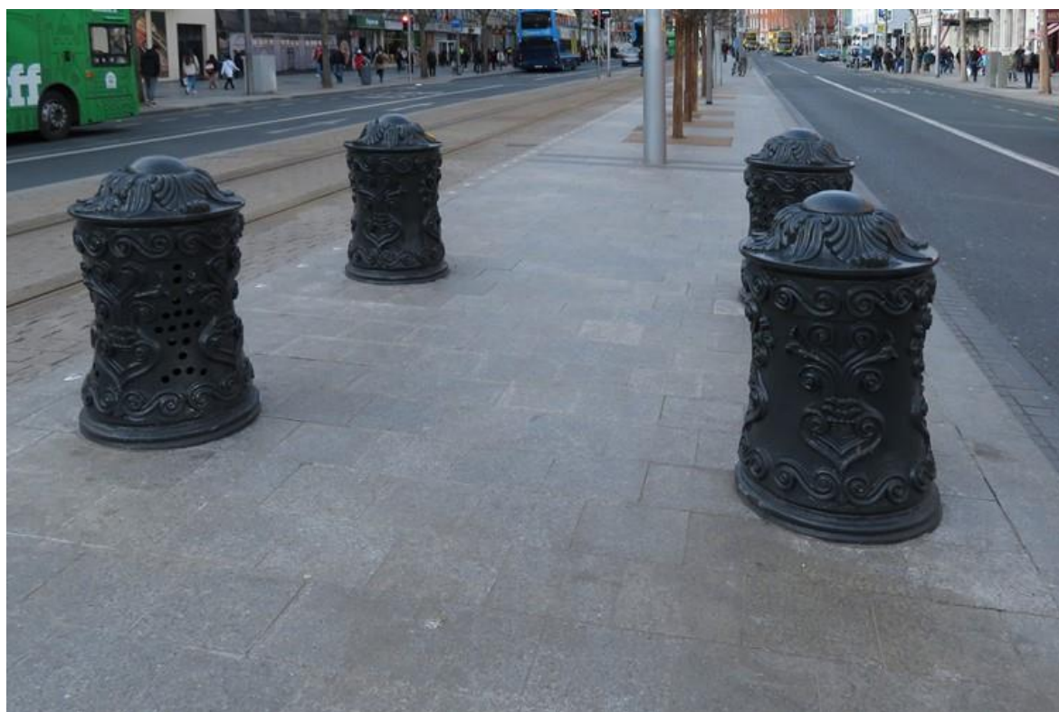
Diagram 1.56: Cast-Iron Vents in O'Connell Street Upper