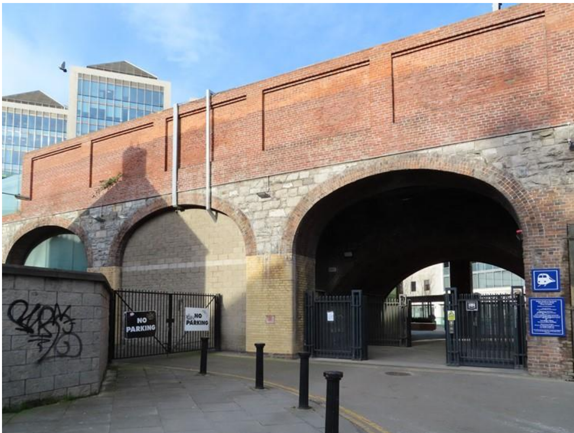
Diagram 1.66: Tara Street DART Station and Loop Line Viaduct