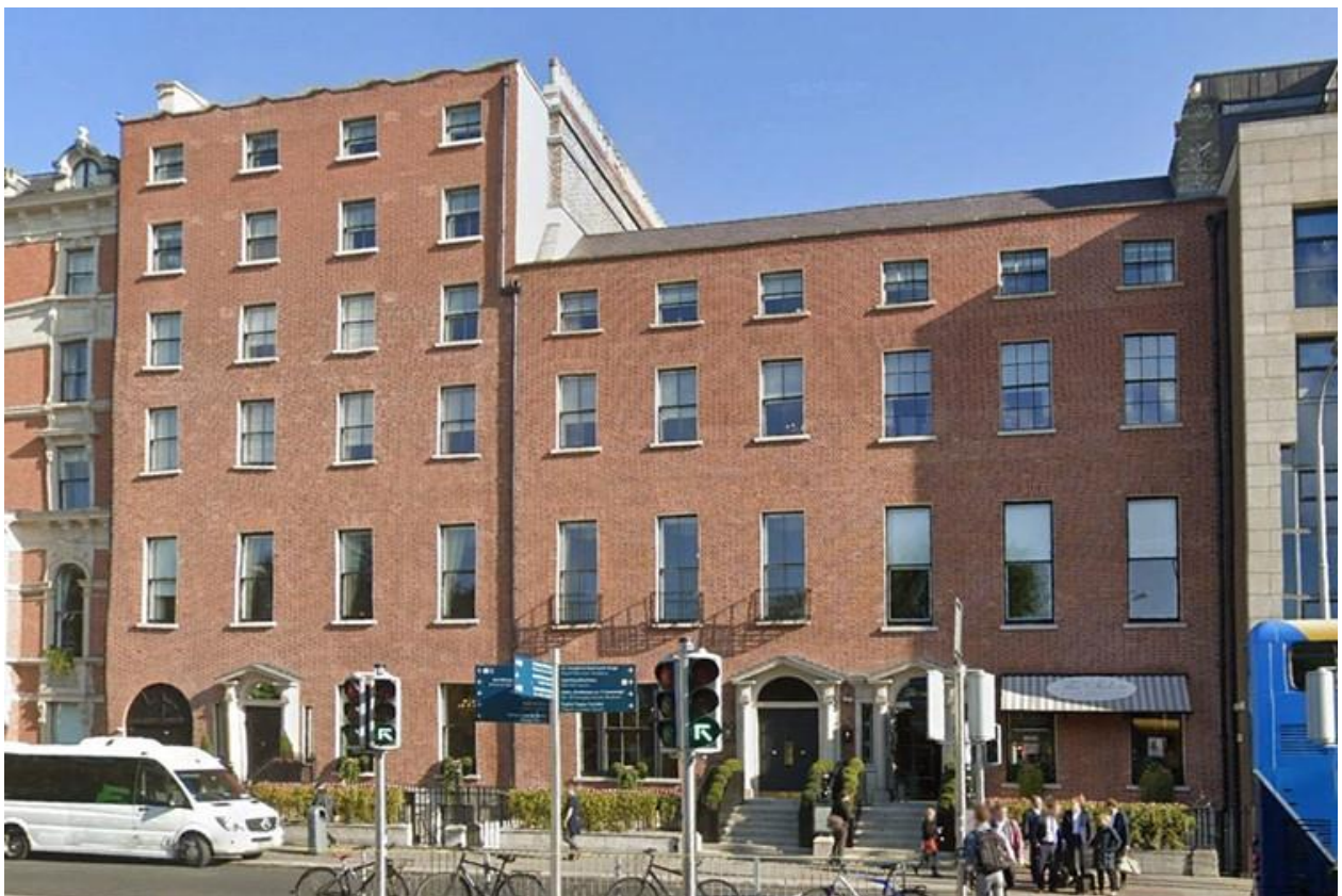
Diagram 1.78: Numbers 34-36 St Stephen's Green