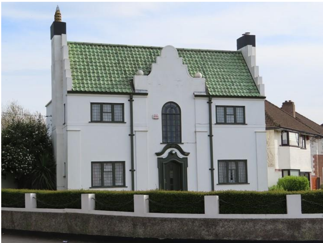
Diagram 1.18: Protected Structure at Corner of Ballymun Road and Hampstead Avenue