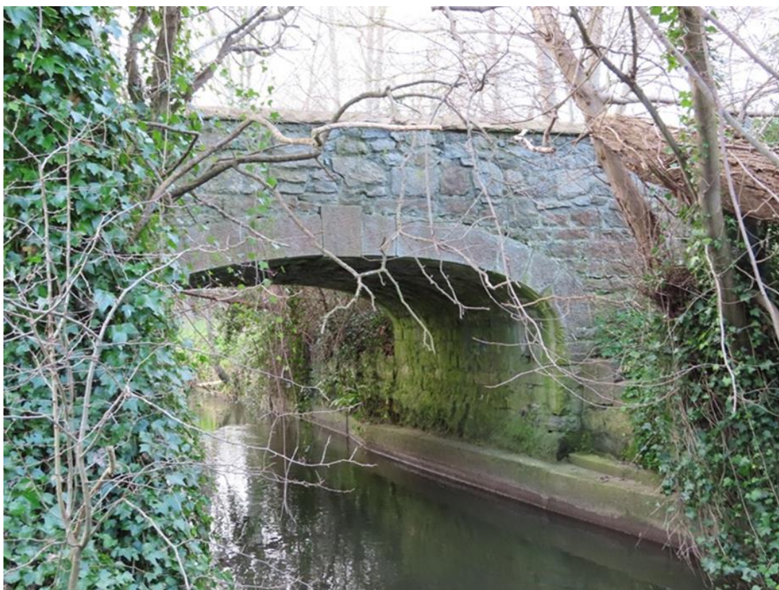
Diagram 1.6: View Upstream from Balheary Bridge