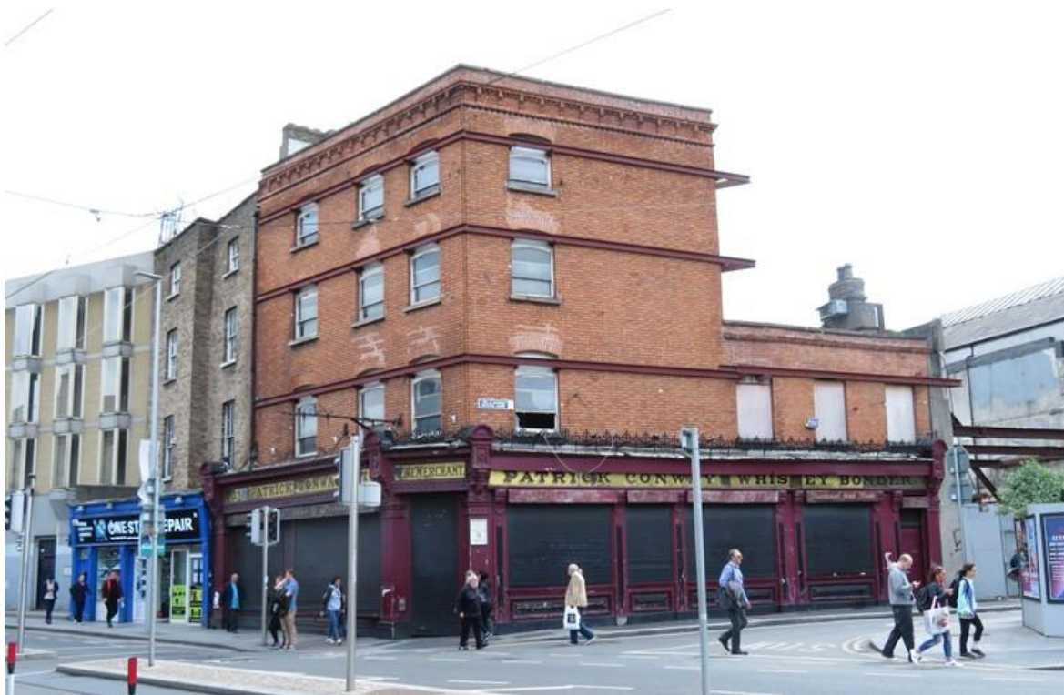
Diagram 1.57: Conway's, 70 Parnell Street