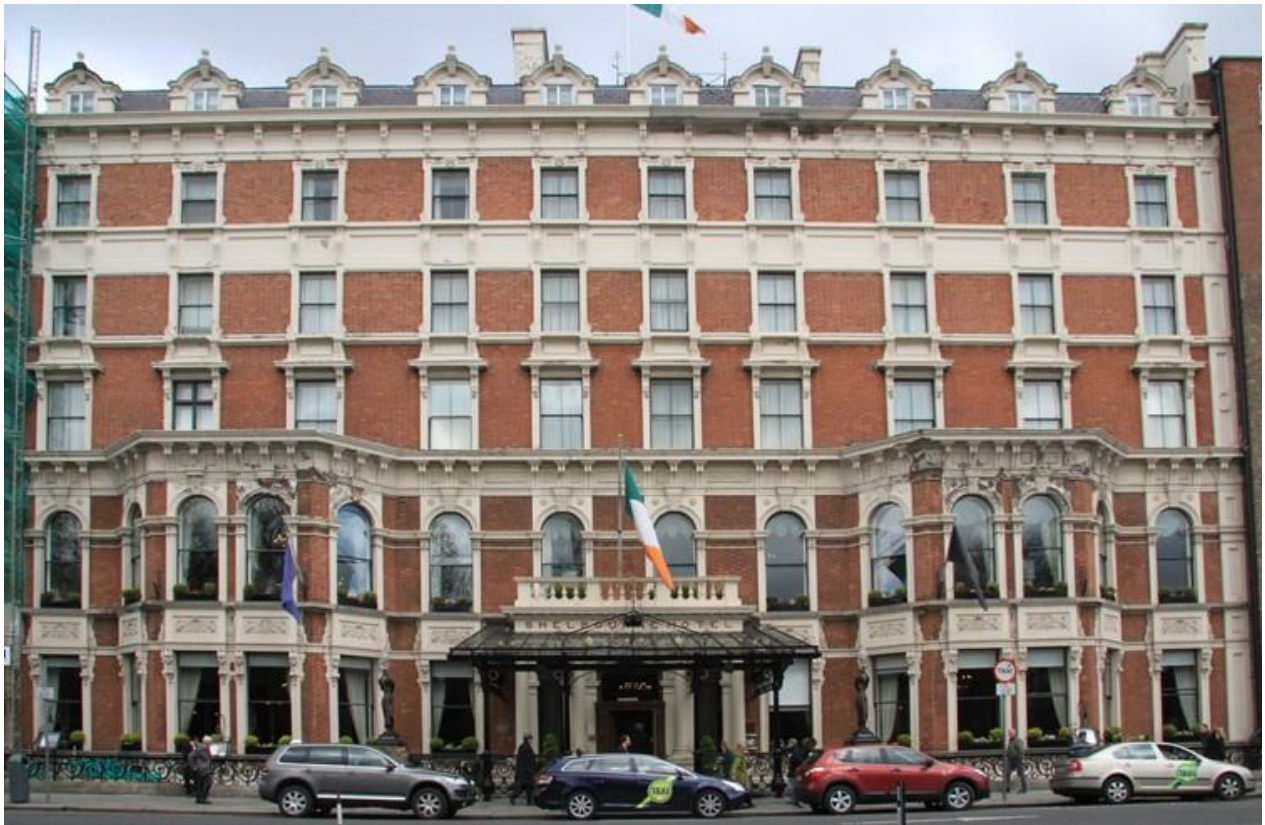
Diagram 1.77: Shelbourne Hotel