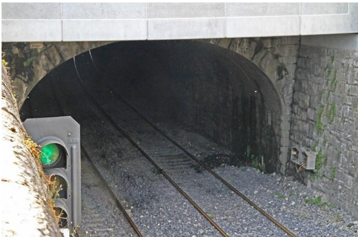
Diagram 1.29: Railway Tunnel at Cross Guns