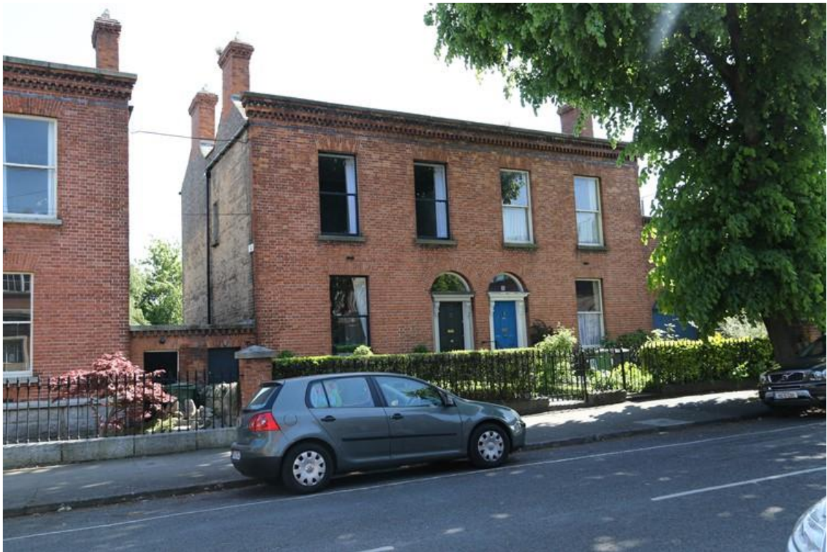
Diagram 1.97: Numbers 32 and 33 Dartmouth Road