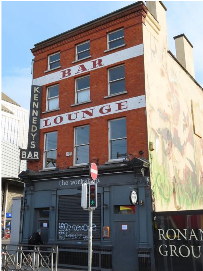
Diagram 1.59: Number 10 George's Quay