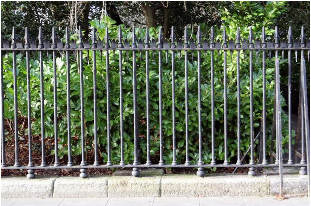
Diagram 1.67: Perimeter Railings at St Stephen's Green