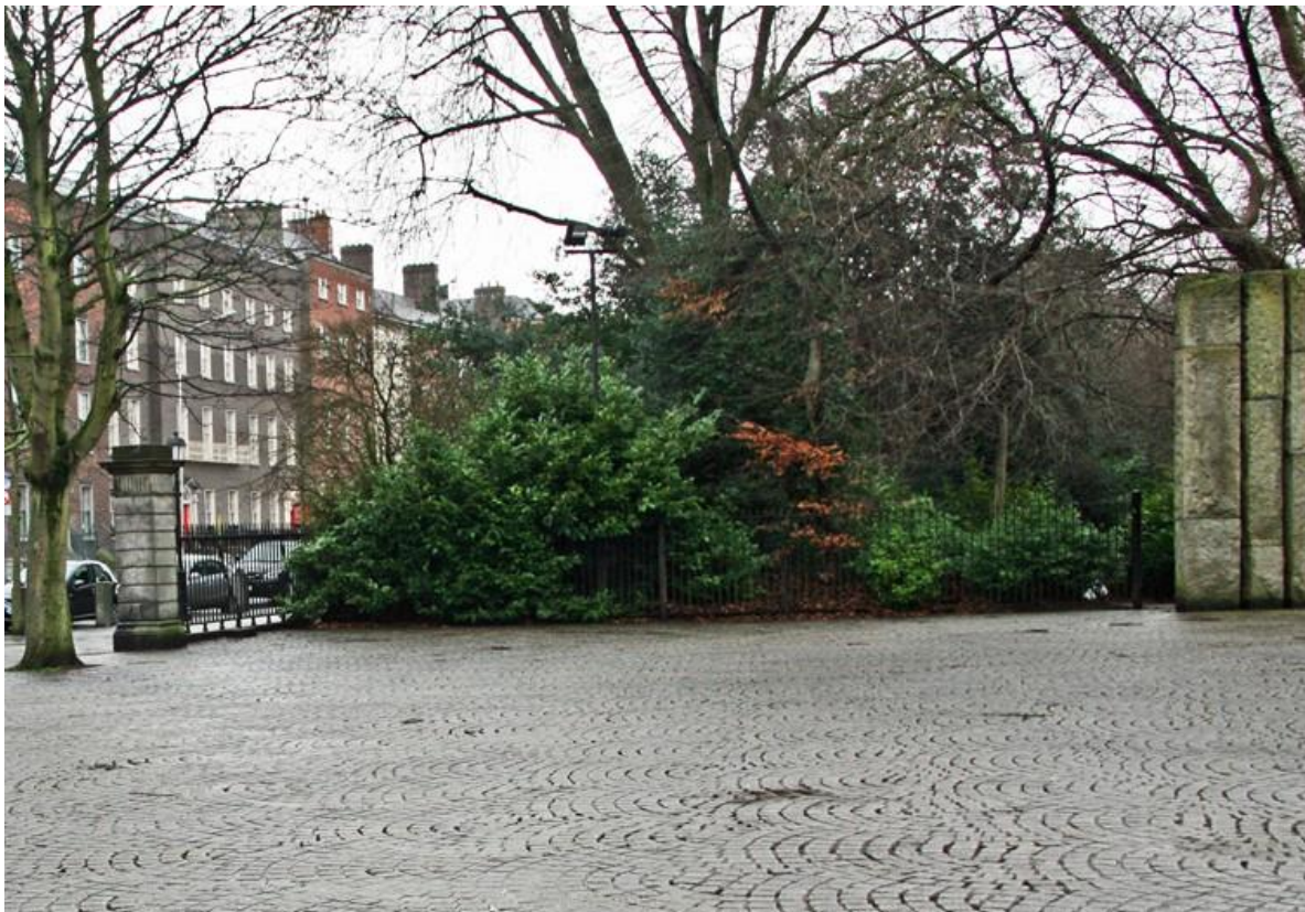
Diagram 1.74: Location of Proposed Entry to St Stephen's Green Station