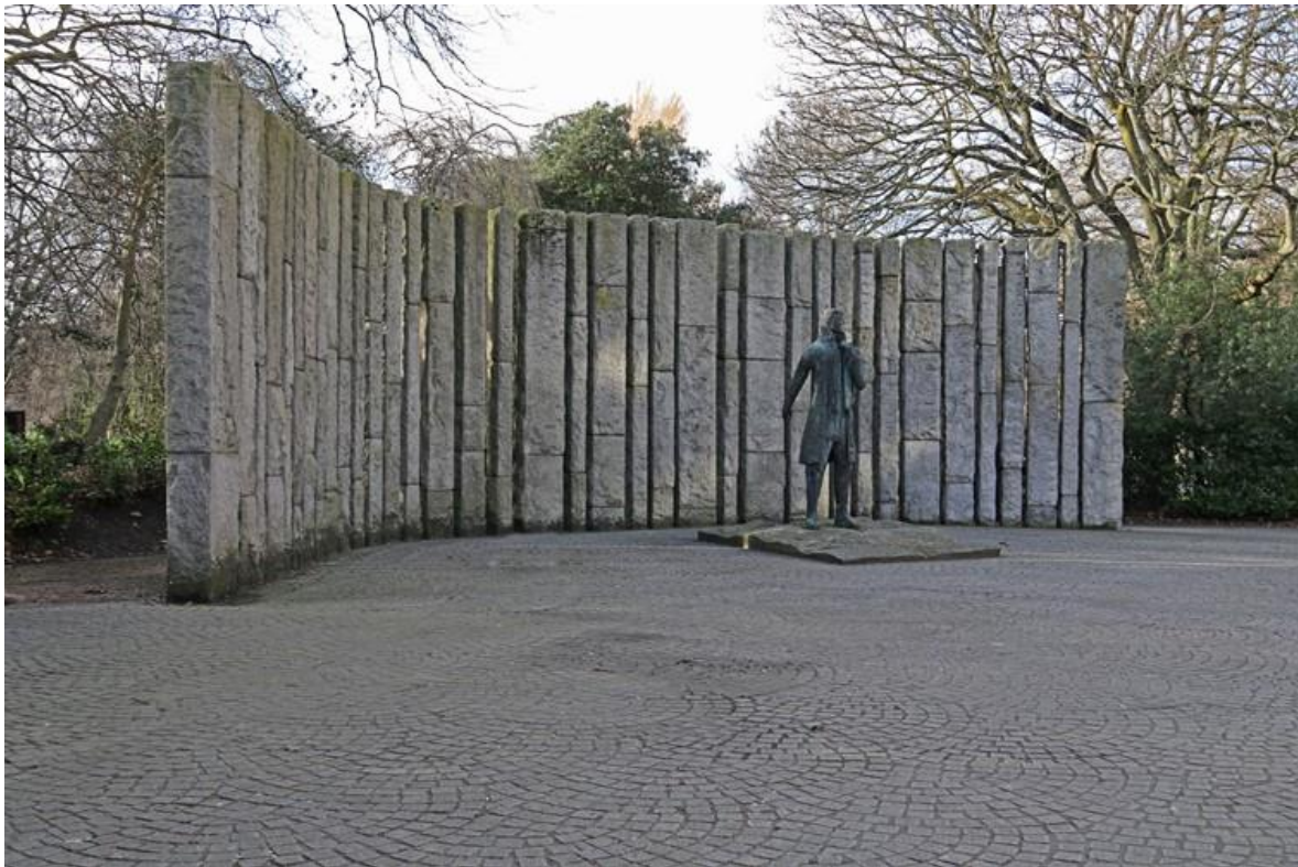
Diagram 1.75: Wolfe Tone Monument