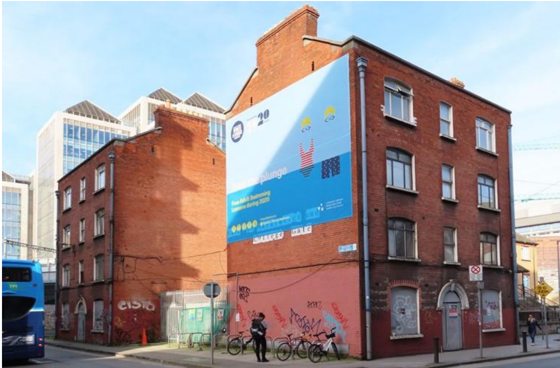
Diagram 1.65: Social Housing at Corner of Townsend Street and Luke Street