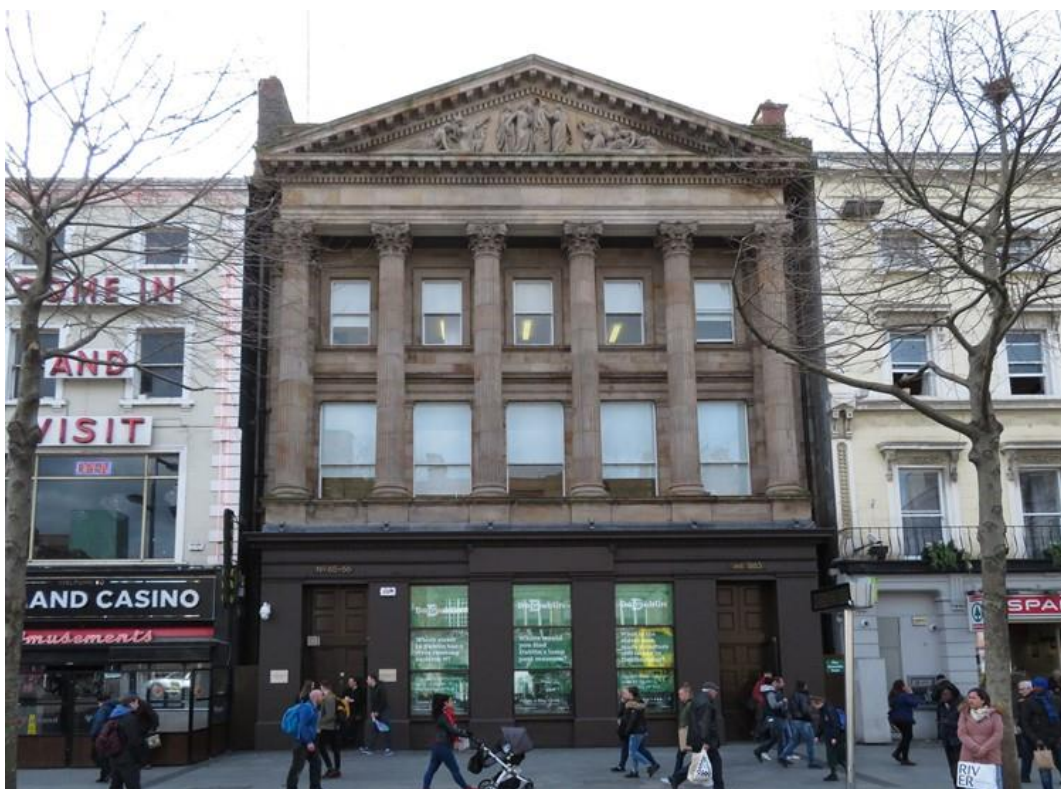
Diagram 1.54: 65-66 O'Connell Street Upper