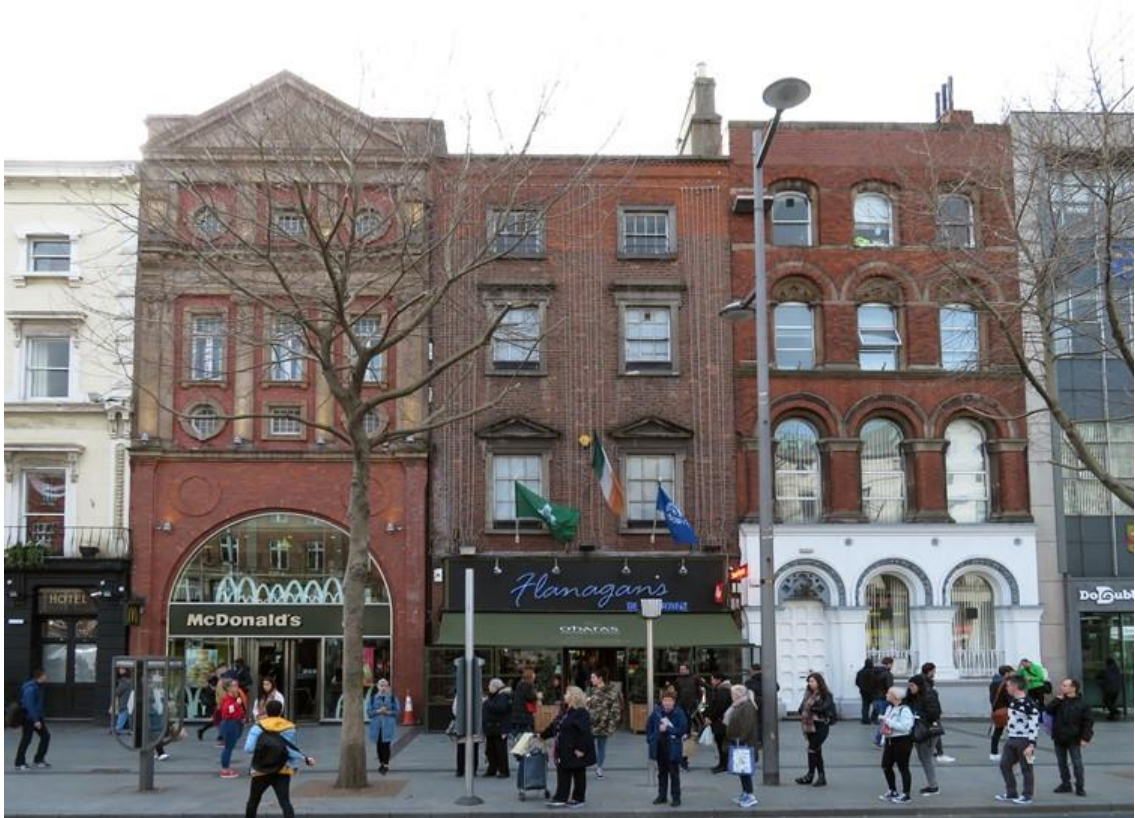
Diagram 1.52: 60 to 62 O'Connell Street Upper