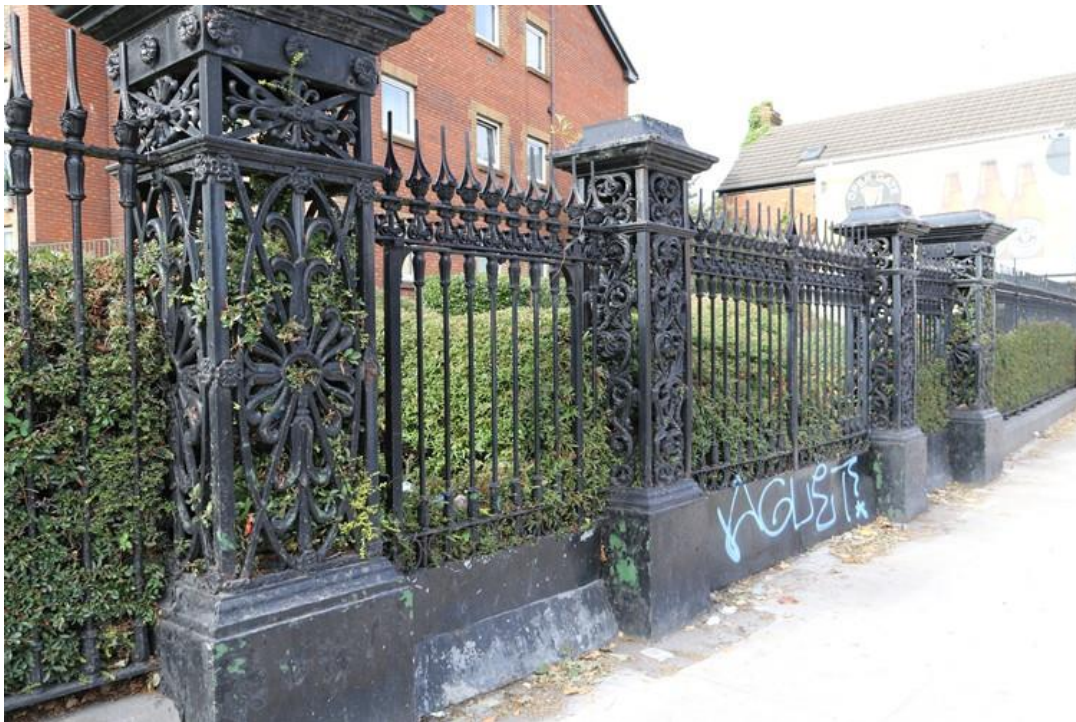
Diagram 1.24: Protected Railings at Dalcassian Downs