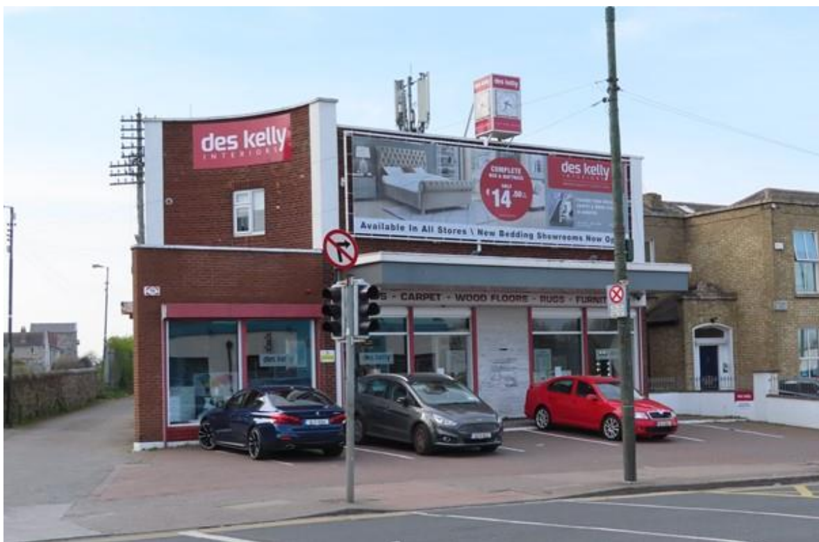
Diagram 1.30: Carpet Showroom, Prospect Road