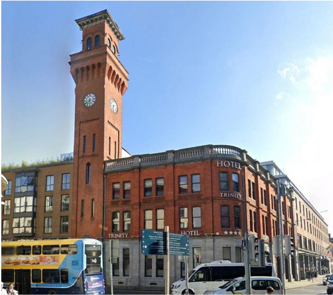
Diagram 1.63: Tara Street Fire Station