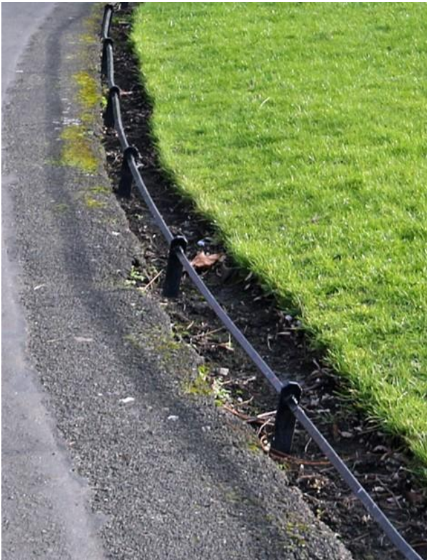
Diagram 1.72: Railing at Edge of Paths, St Stephen's Green Park