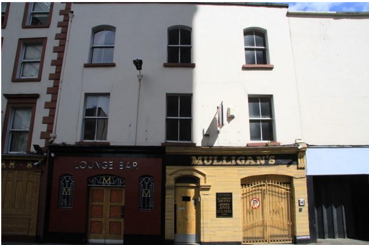
Diagram 1.62: Number 9 Poolbeg Street