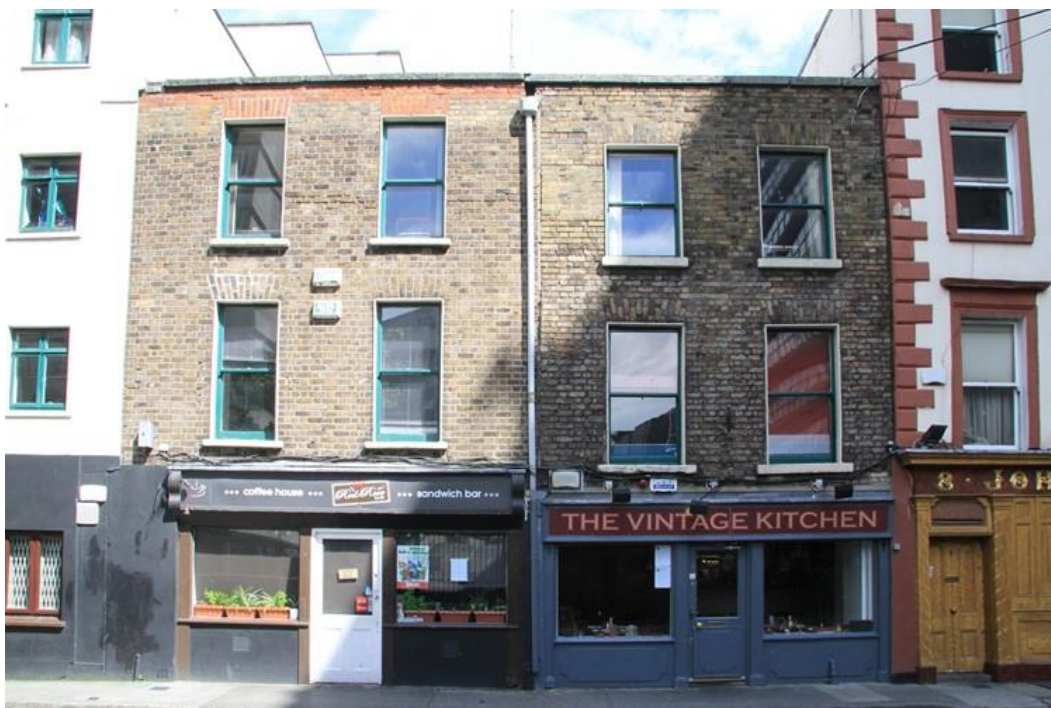
Diagram 1.60: Numbers 7 and 7a Poolbeg Street