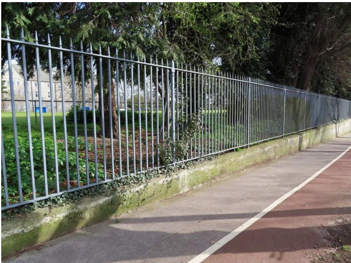
Diagram 1.22: Railings on Road Frontage at Home Farm Football Club