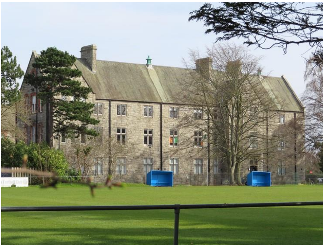
Diagram 1.20: Site for Griffith Park Station, Looking South