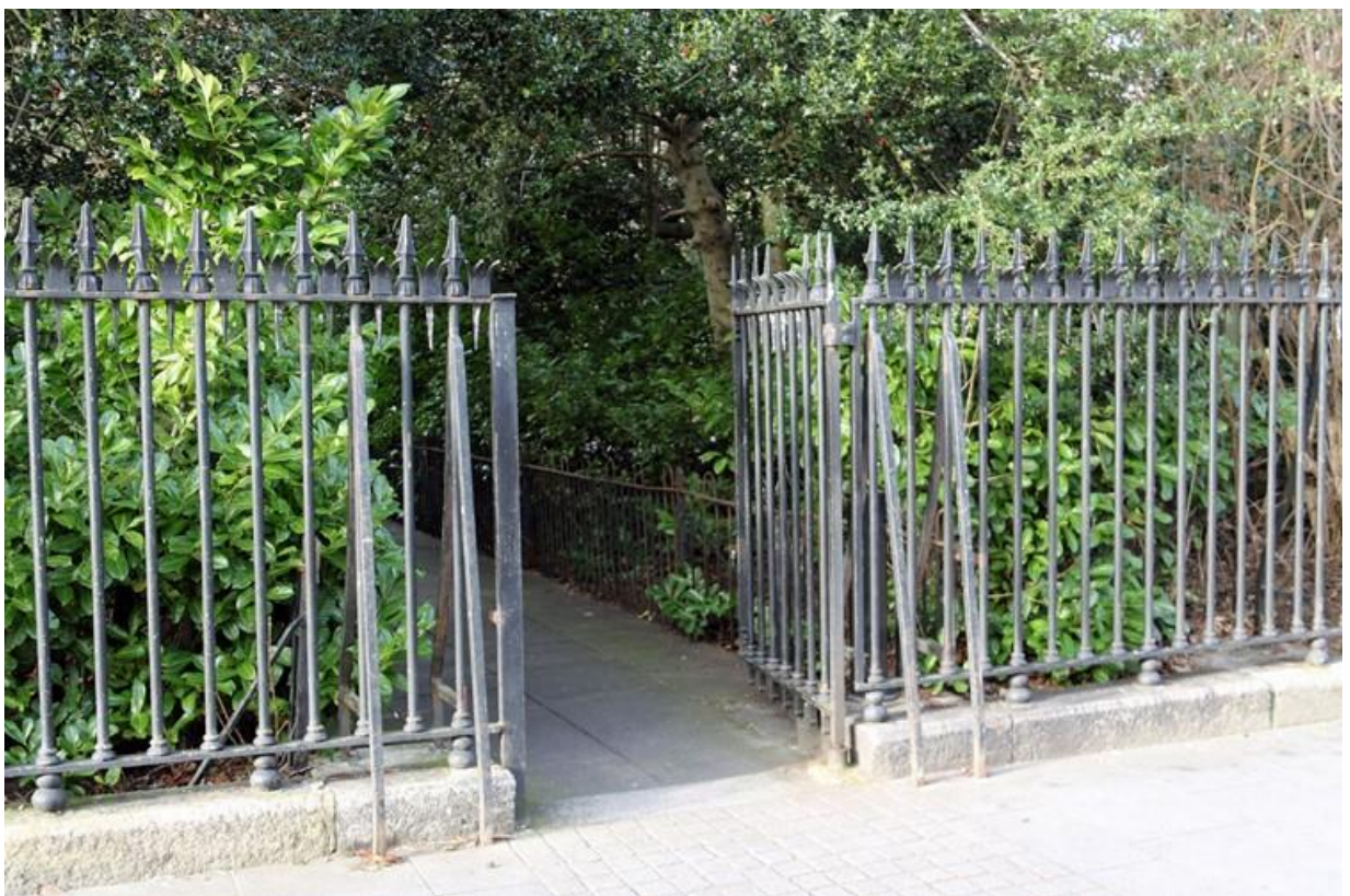
Diagram 1.68: Perimeter Railings, Wicket Gate and Railings Inside Gate