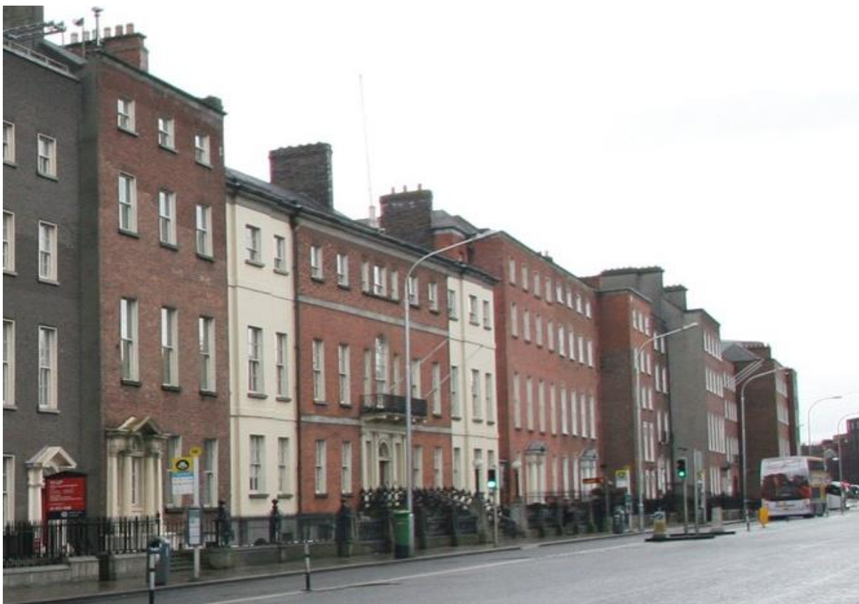
Diagram 1.82: Numbers 50 to 60 St Stephen's Green