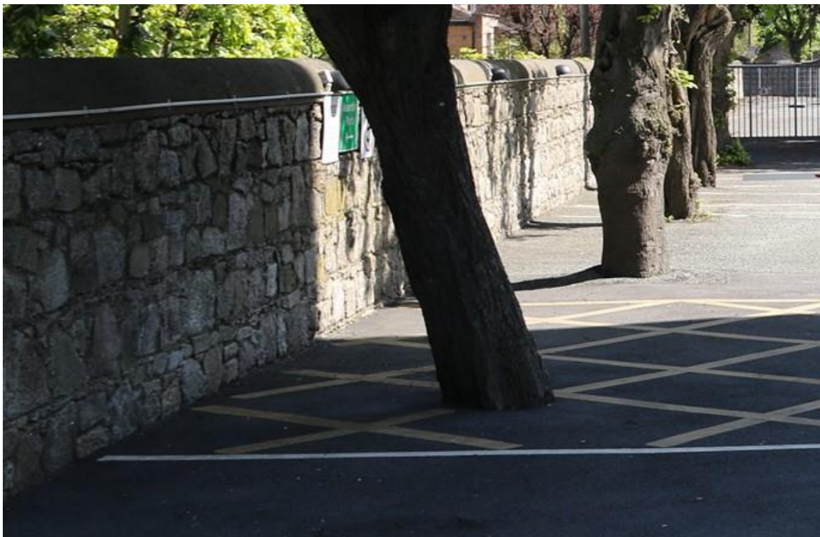
Diagram 1.90: Wall between Site of Carroll's Building and Laneway at Rear of Dartmouth Square