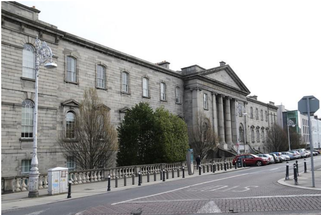
Diagram 1.33: Mater Hospital, Eccles Street