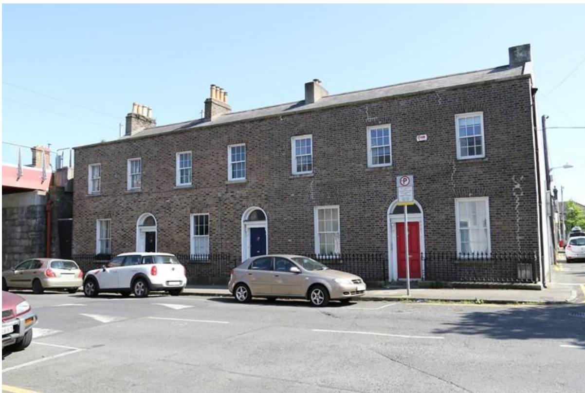
Diagram 1.100: Numbers 29 to 31 Dartmouth Road