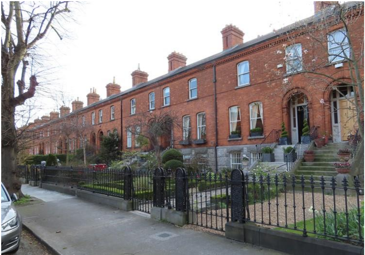
Diagram 1.93: Numbers 1-17 Dartmouth Square