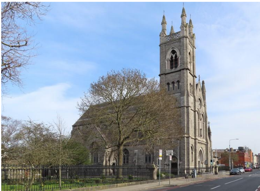
Diagram 1.38: St Joseph's Church, Berkeley Road