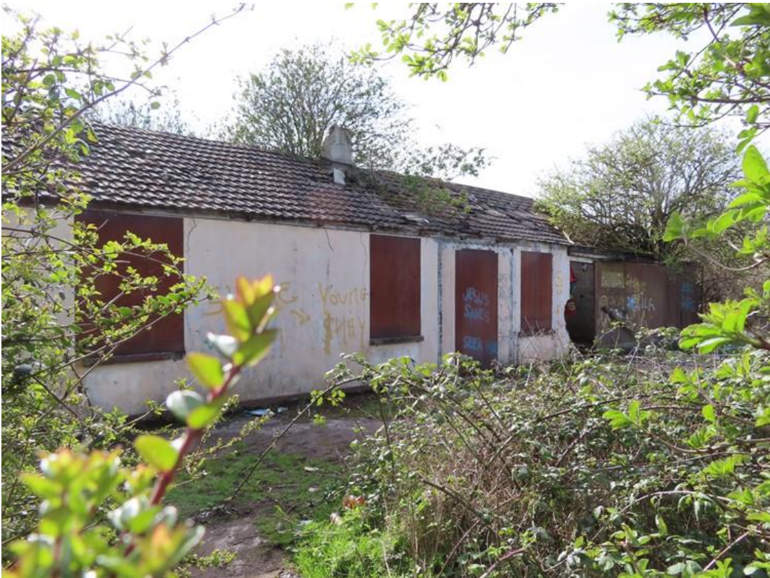
Diagram 1.14: House to the South of Santry Lodge