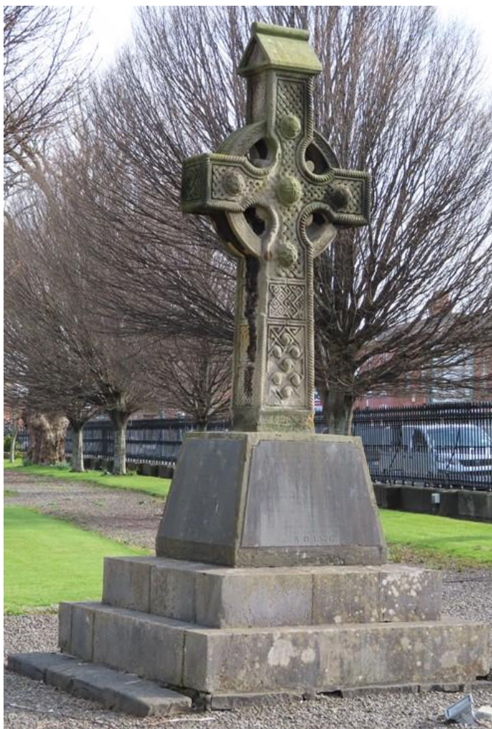
Diagram 1.36: Four Masters Cross