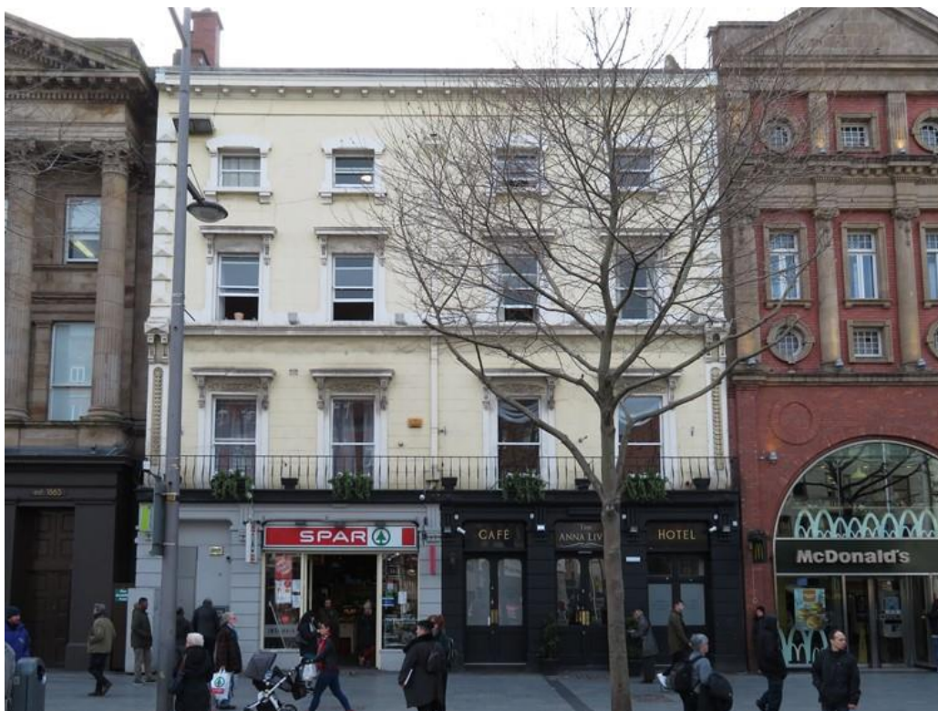
Diagram 1.53: 63-64 O'Connell Street Upper