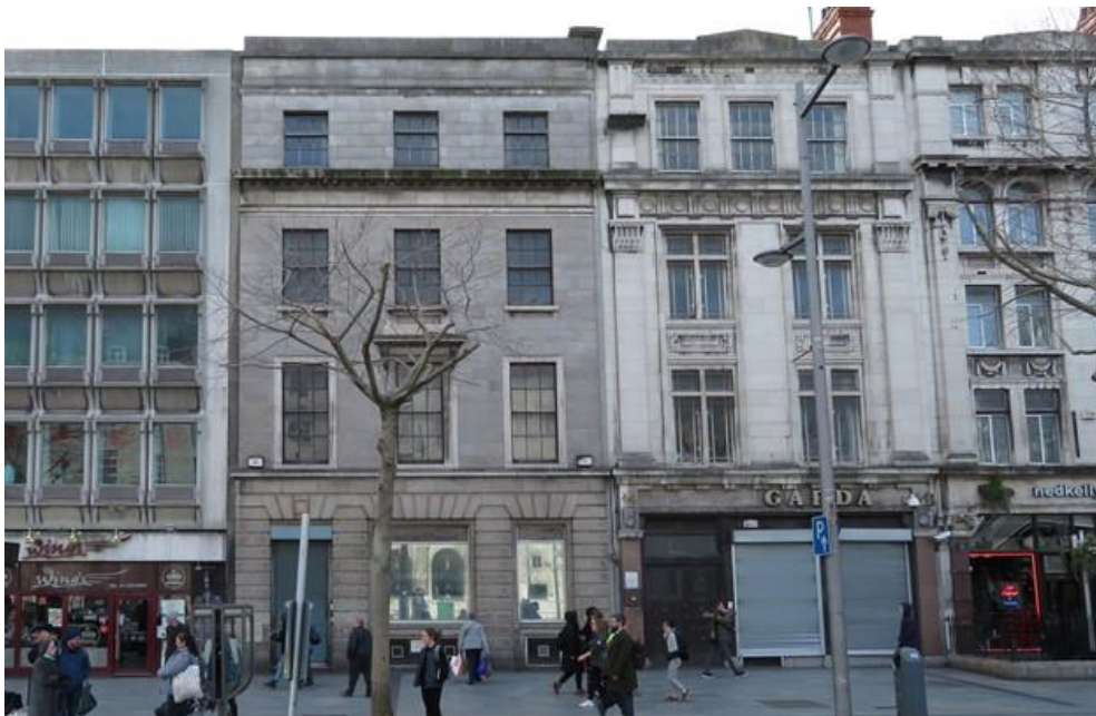
Diagram 1.48: 44 and 45 O'Connell Street Upper