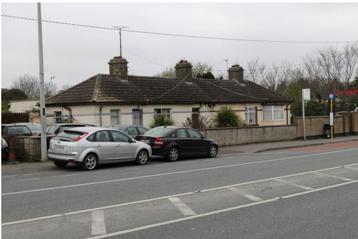
Diagram 1.10: Houses at Nevinstown West