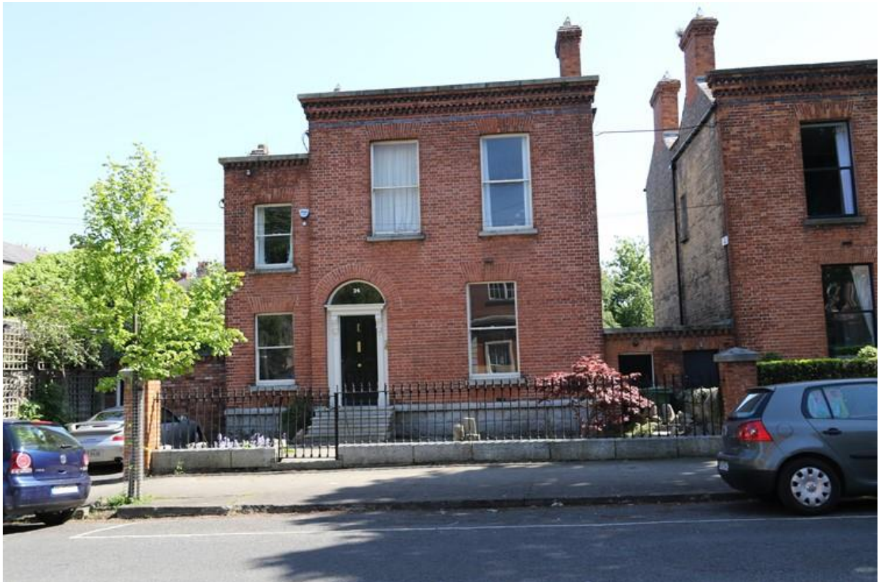
Diagram 1.98: Number 34 Dartmouth Road