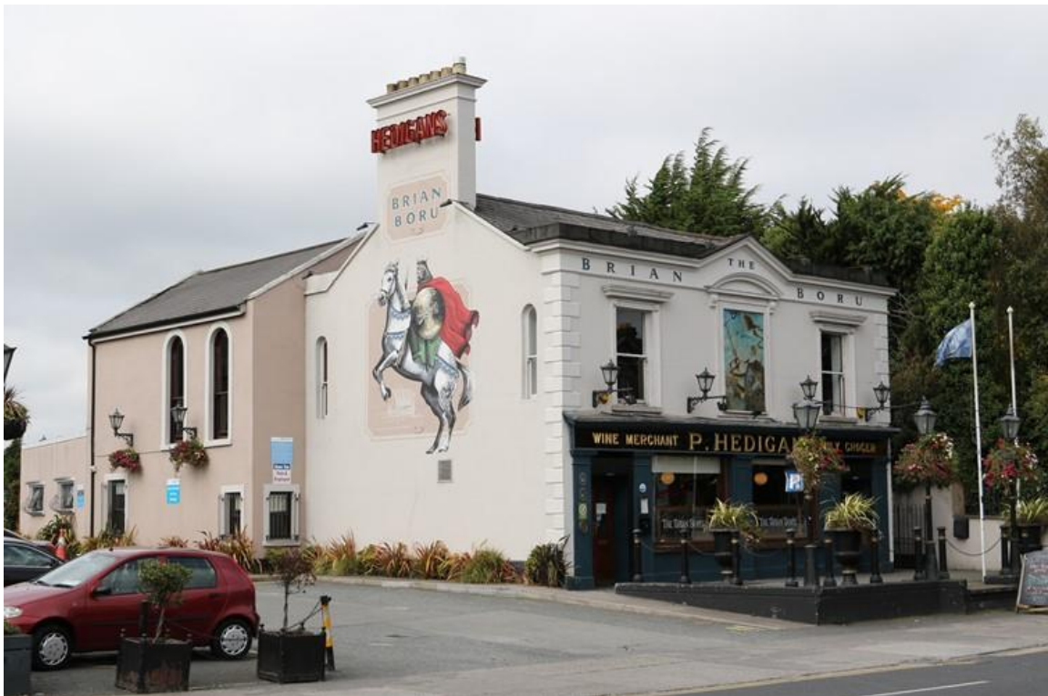
Diagram 1.32: Brian Boru Licensed Premises, Prospect Road