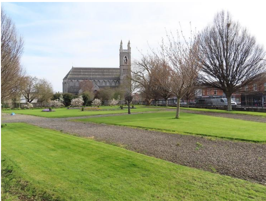
Diagram 1.34: Park at Corner of Eccles Street and Berkeley Road