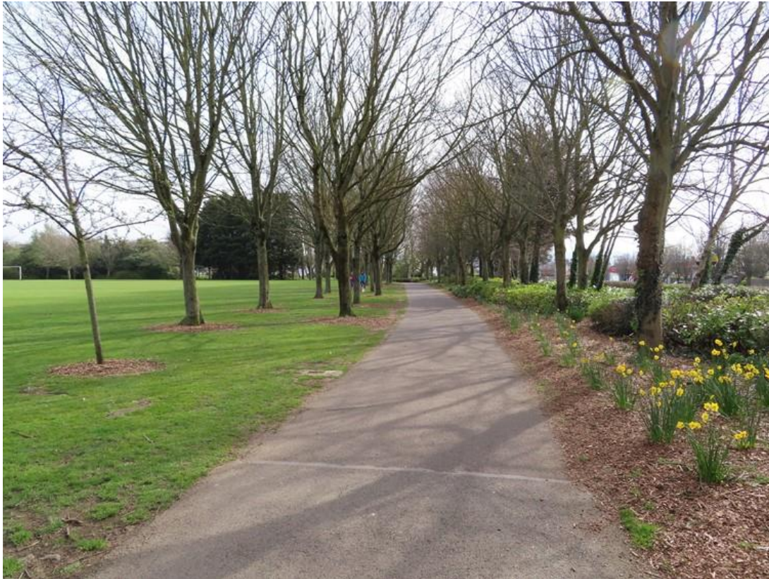
Diagram 1.17: Proposed Site for Intervention Shaft, Albert College Park