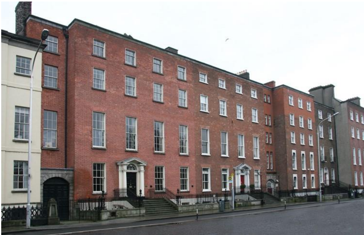
Diagram 1.84: Numbers 42 to 45 St Stephen's Green