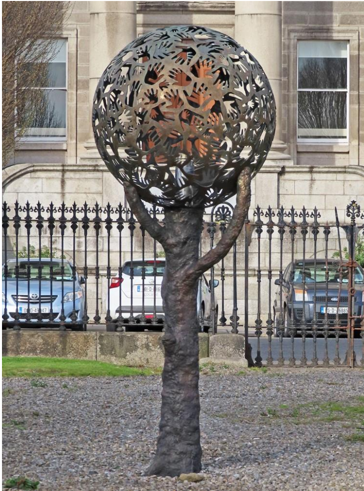
Diagram 1.37: Healing Hands Sculpture