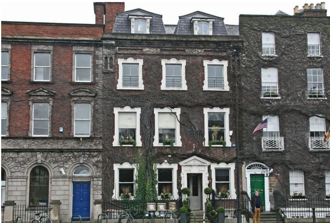
Diagram 1.80: Number 41 St Stephen's Green