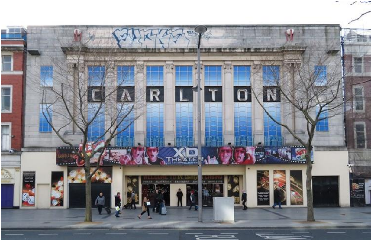
Diagram 1.49: Carlton Cinema, 52-54 O'Connell Street Upper