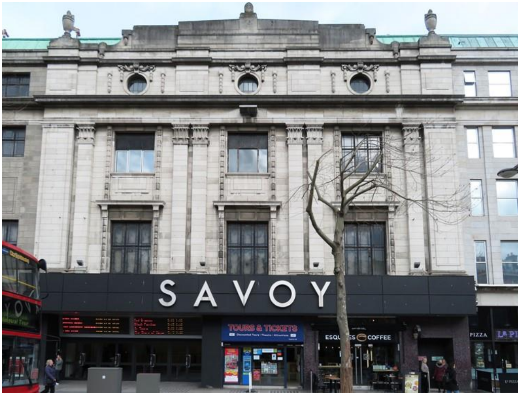
Diagram 1.41: Savoy Cinema, 16-17 O'Connell Street Upper