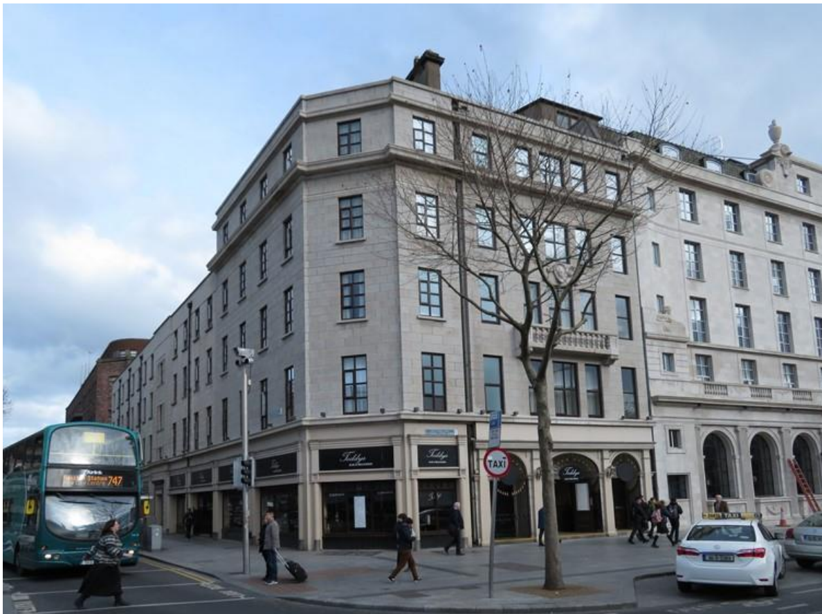
Diagram 1.44: Numbers 23 and 24 O'Connell Street Upper